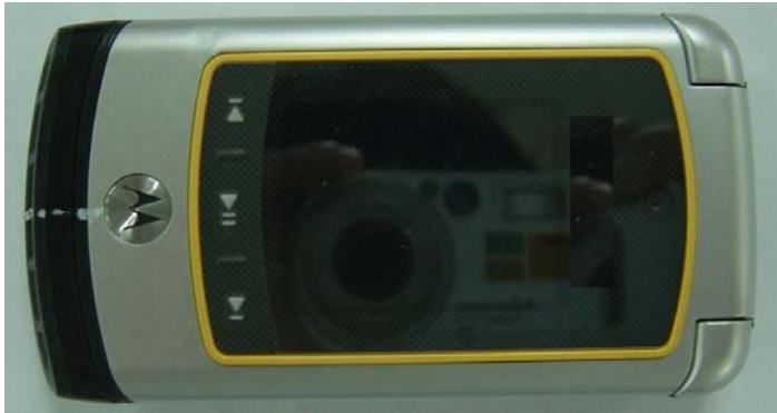
Figure A5-1. Phone Closed