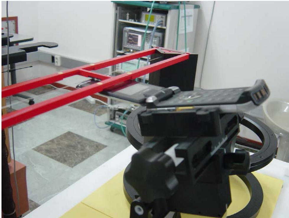
Figure A5-4. Positioning for RF Emissions