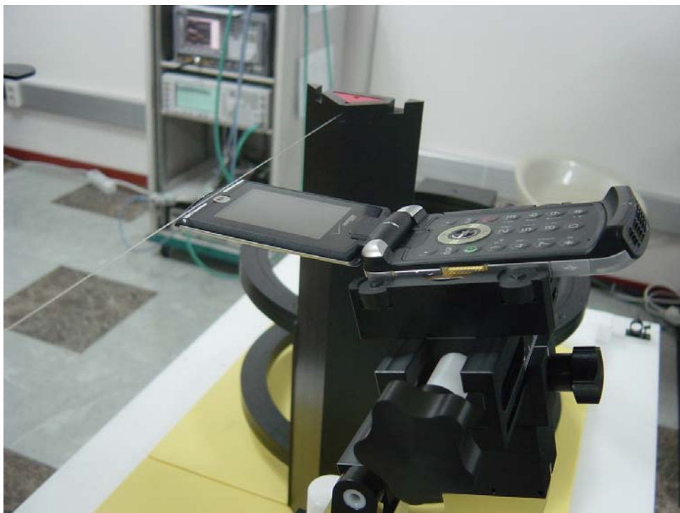
Figure A5-5. Measurement for RF Emissions