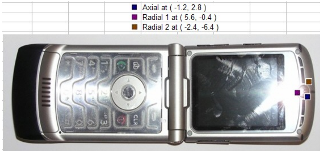
Figure A4-5. Location of Measured Points for T-coil measurements