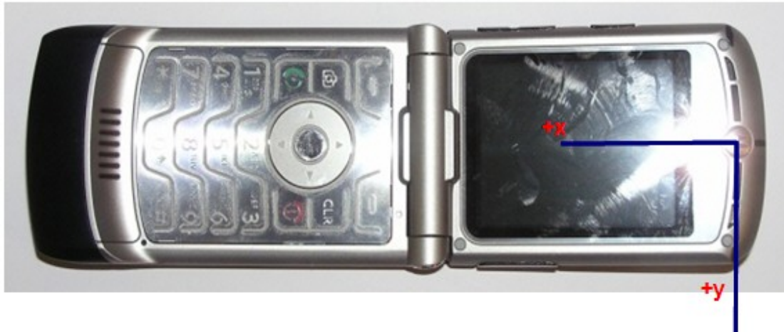
Figure A4-4. Coordinate Axis for T-coil Measurements