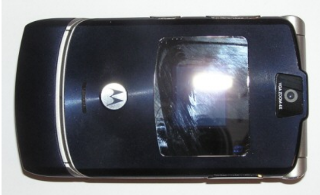
Figure A4-1. Phone Closed