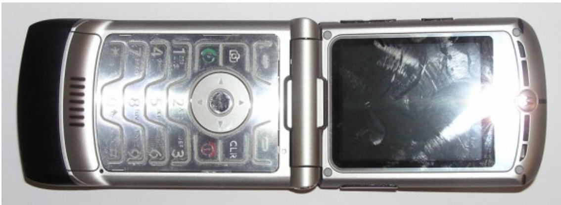
Figure A4-2. Phone Open