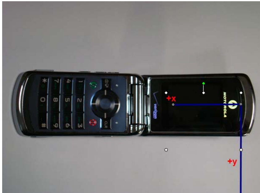
Figure 4. Coordinate Axis for T-coil Measurements