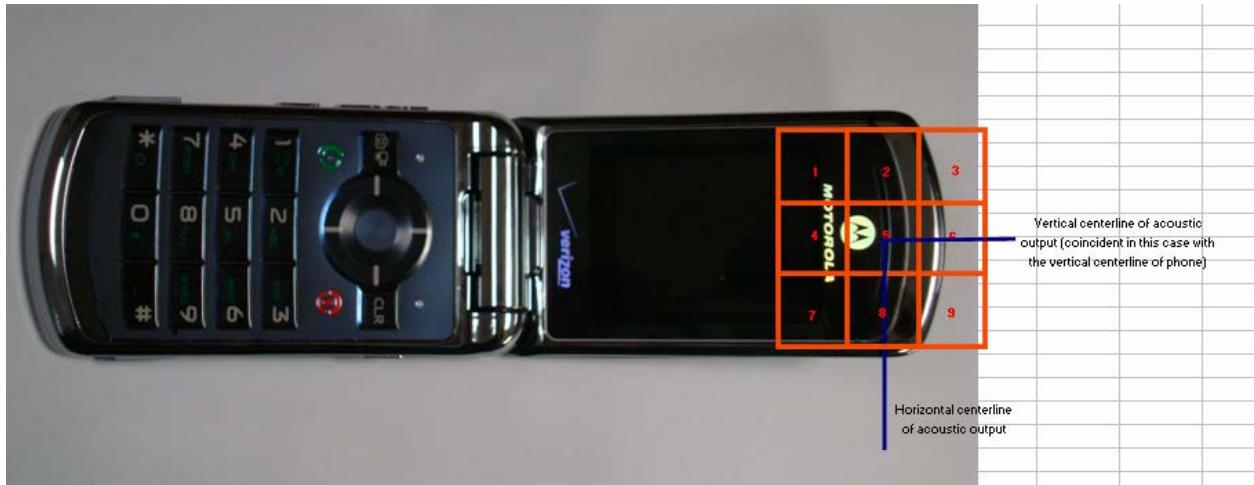
Figure 3. Phone Open - Orientation and Measurement Plane for RF Emissions Testing