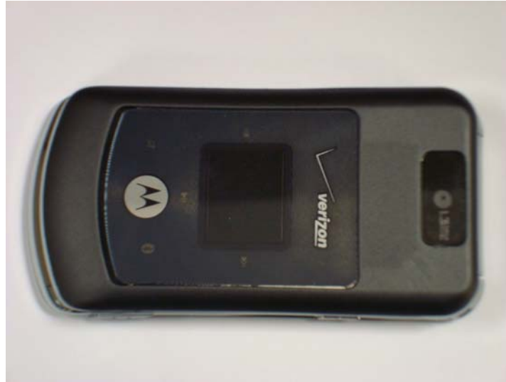
Figure 1. Phone Closed