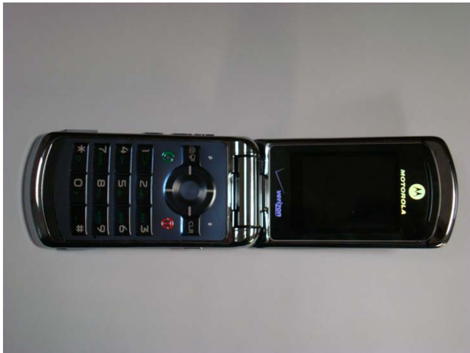
Figure 2. Phone Open