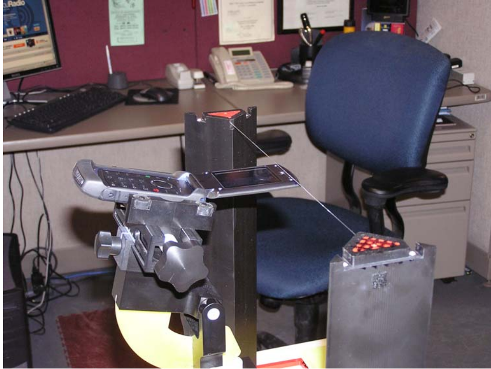
Figure 5. Measurement for RF Emissions