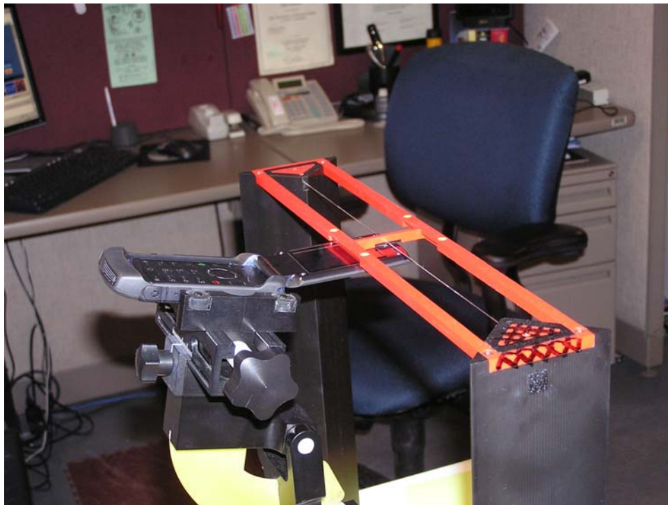
Figure 4. Positioning for RF Emissions