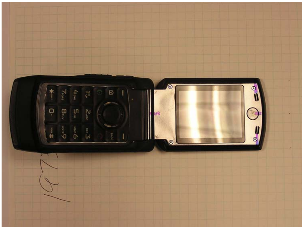
Figure 2. Phone Open