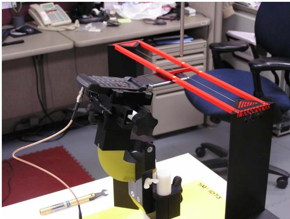
Figure 8. Positioning and Measurement for T-coil