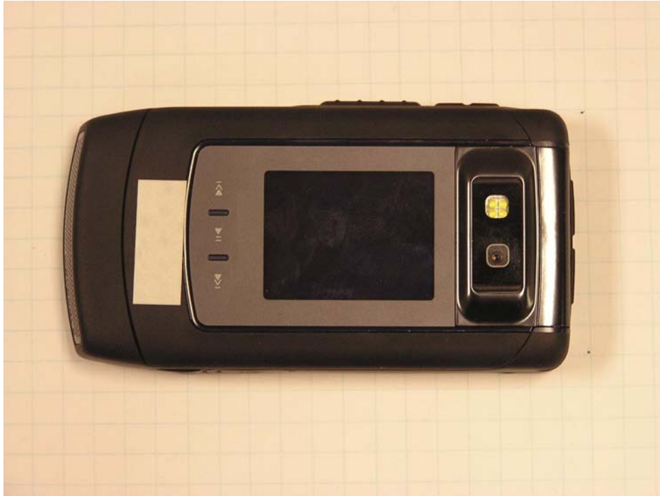
Figure 1. Phone Closed