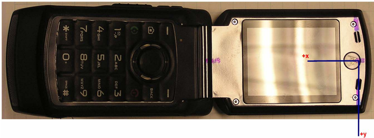
Figure 6. Coordinate Axis for T-coil Measurements