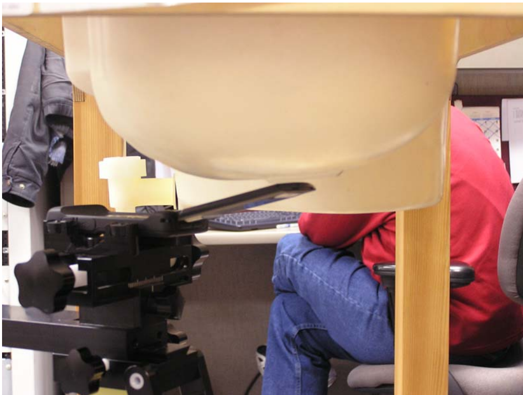
Figure 6 – Transceiver against head, 15° Tilt position