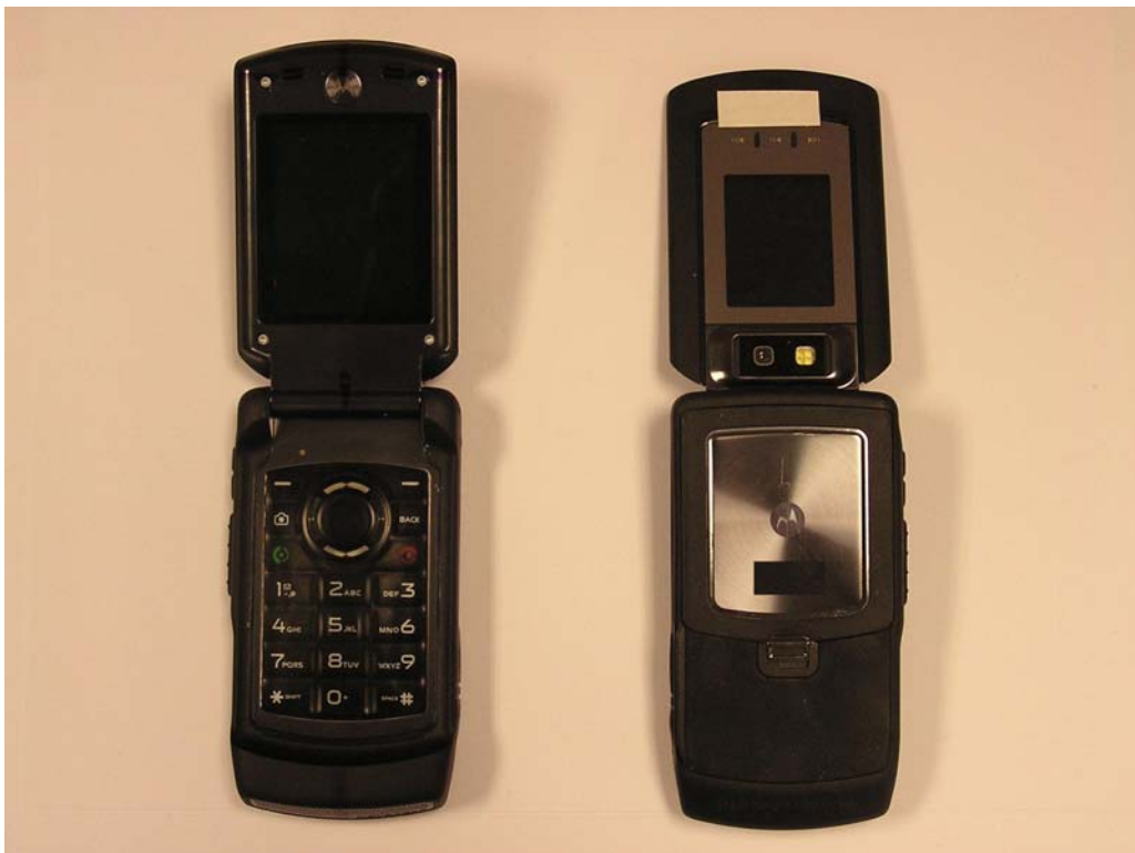
Figure 2 – Transceiver Open