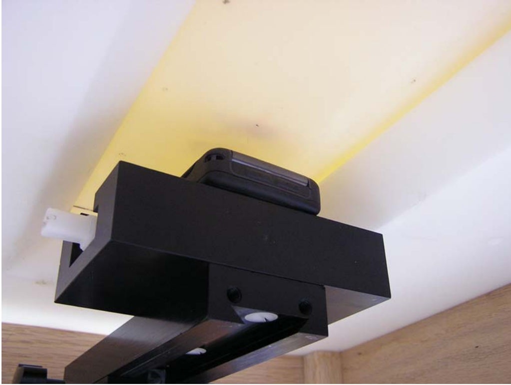
Figure 7 – Transceiver against body, Back of Phone 15 mm from Phantom position