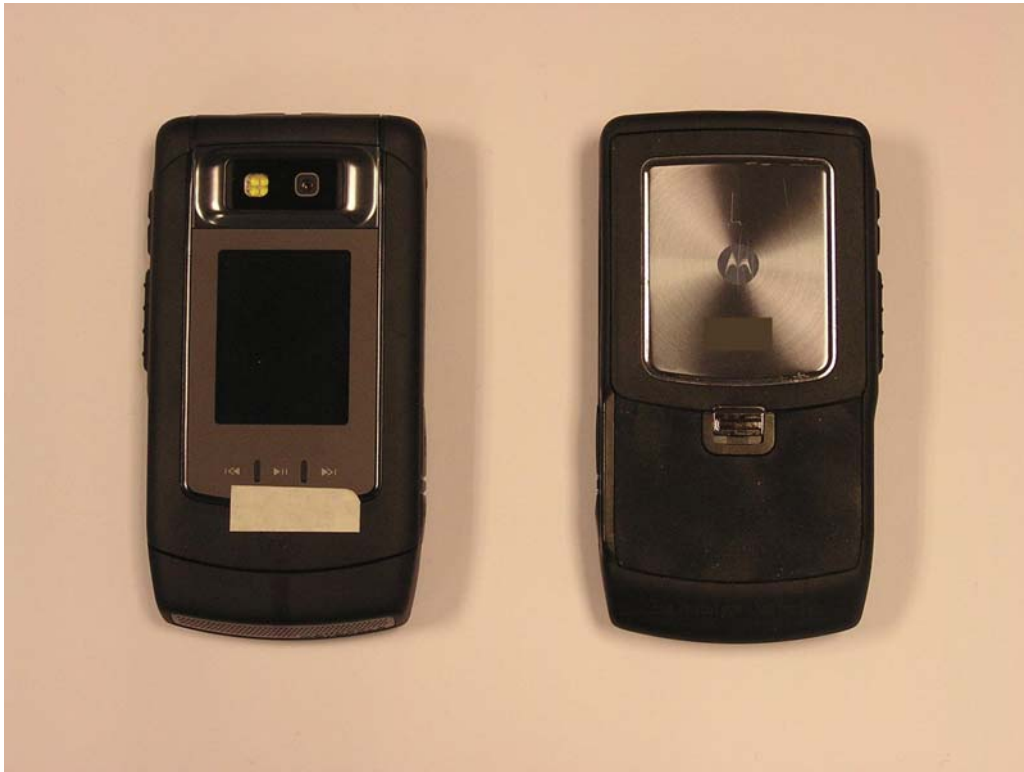
Figure 1 – Transceiver Closed