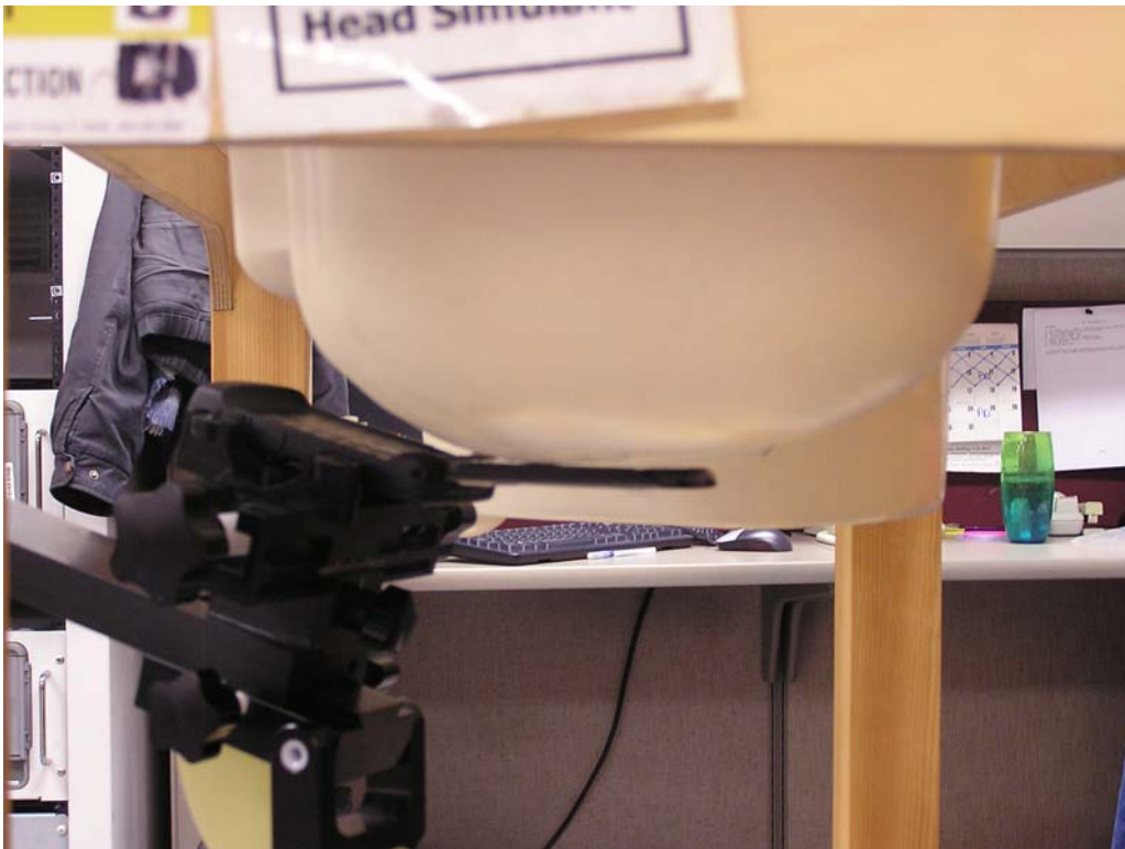
Figure 4 – Transceiver against head, Cheek Touch position