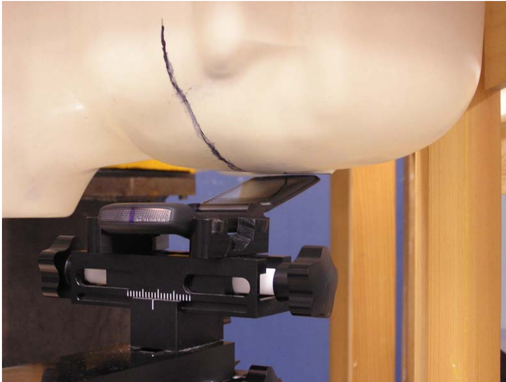
Figure 5 – Transceiver against head, 15° Tilt position