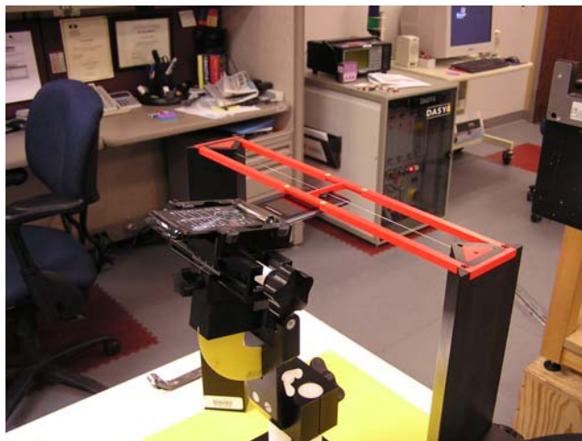
Figure A4-3. View from the side