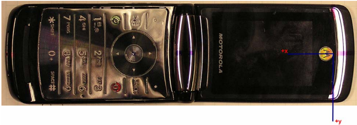
Figure A4-4. Phone Open – Coordinate Axis for T-coil Measurements