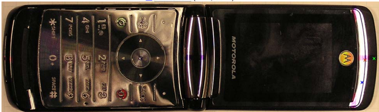
Figure A4-5. Phone Open – Location of Measured Points