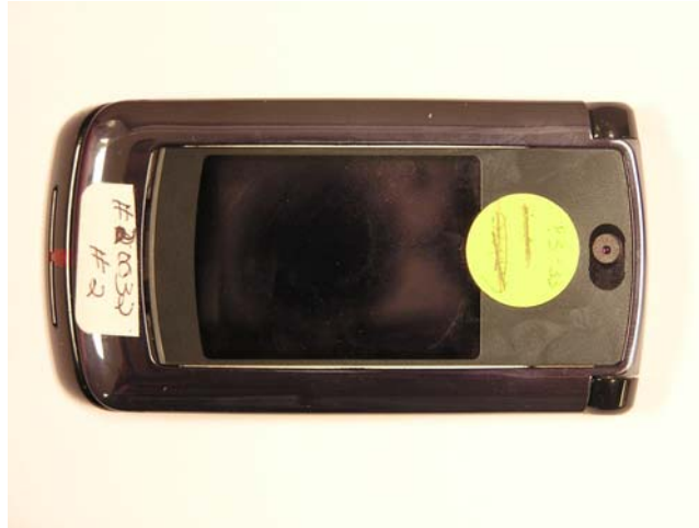
Figure A4-1. Phone Closed