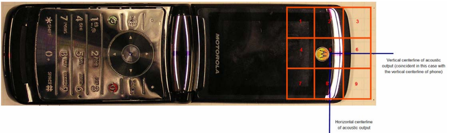
Figure A4-6. Phone Open – 5 cm x 5 cm grid for Near Field Measurements