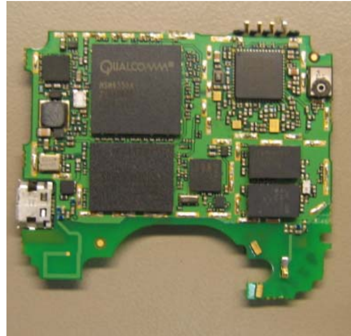
Main Board Top Without Shields