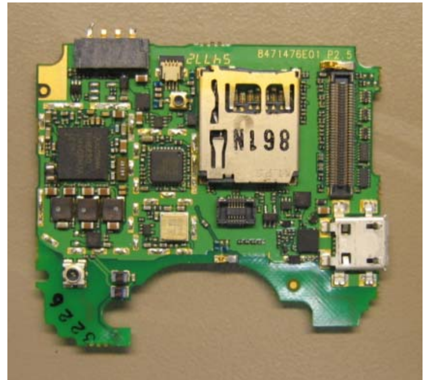
Main Board Back without Shields