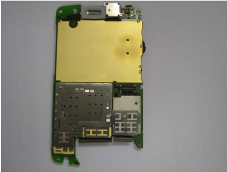
Main PCB w/ shields – Front Side