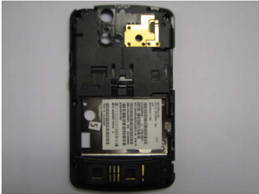
Rear Housing Exterior