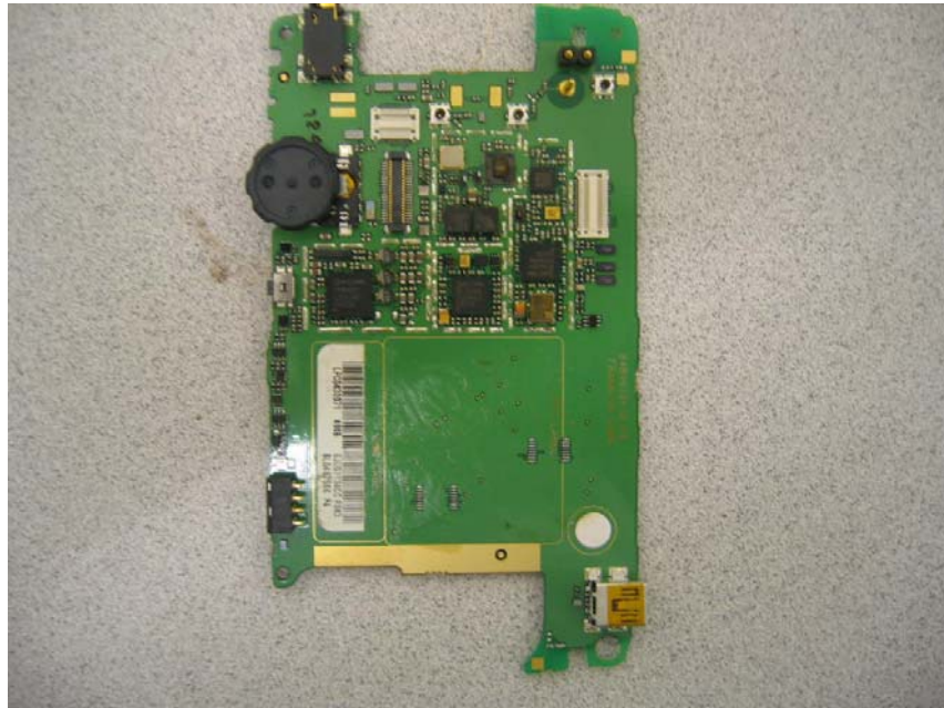
Main PCB w/ no shields – Back Side