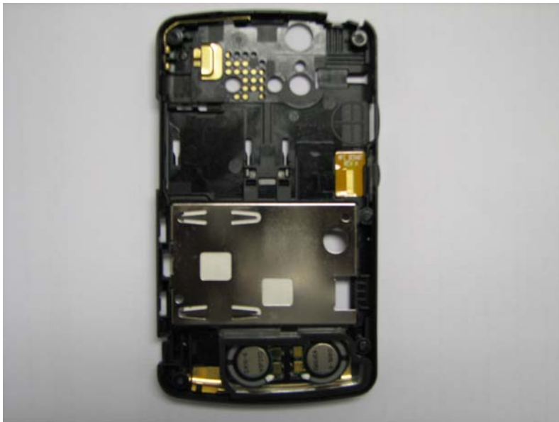
Interior Rear Housing