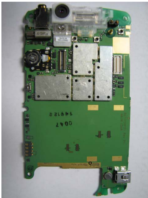
Main PCB w/ shields – Back Side