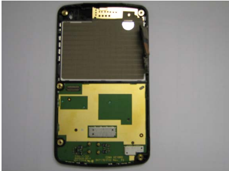
Interior Front Housing