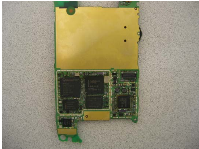
Main PCB w/no shields – Front Side