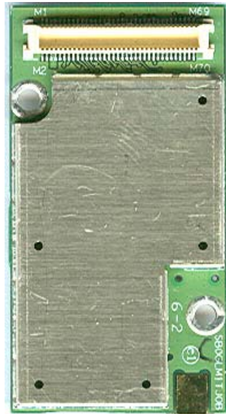
Rear View (With Shield)