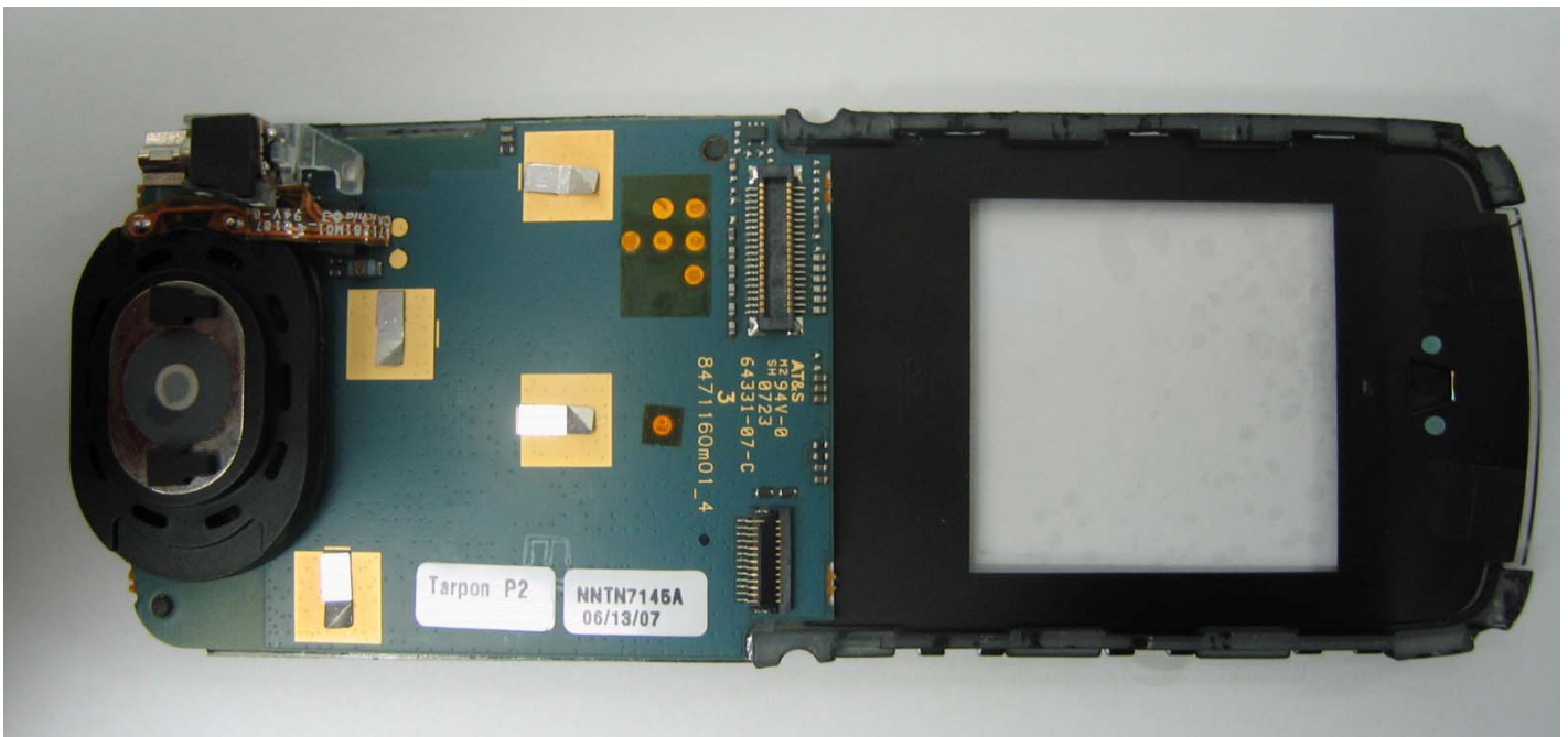
Photograph 9-2: Back side view of radio product Keypad PC Board