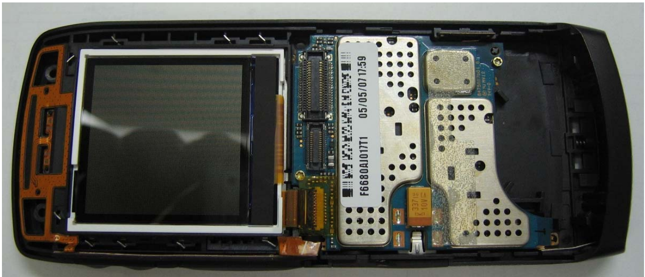
Photograph 9-2: Front side view of radio product PC Board with Keypad PC Board detached