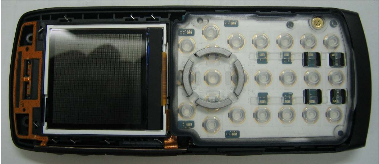
Photograph 9-1: Front side view of radio product PC Board