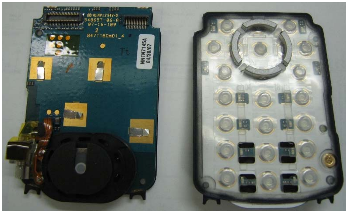
Photograph 9-4: Front and Back side view of keypad PC Board.