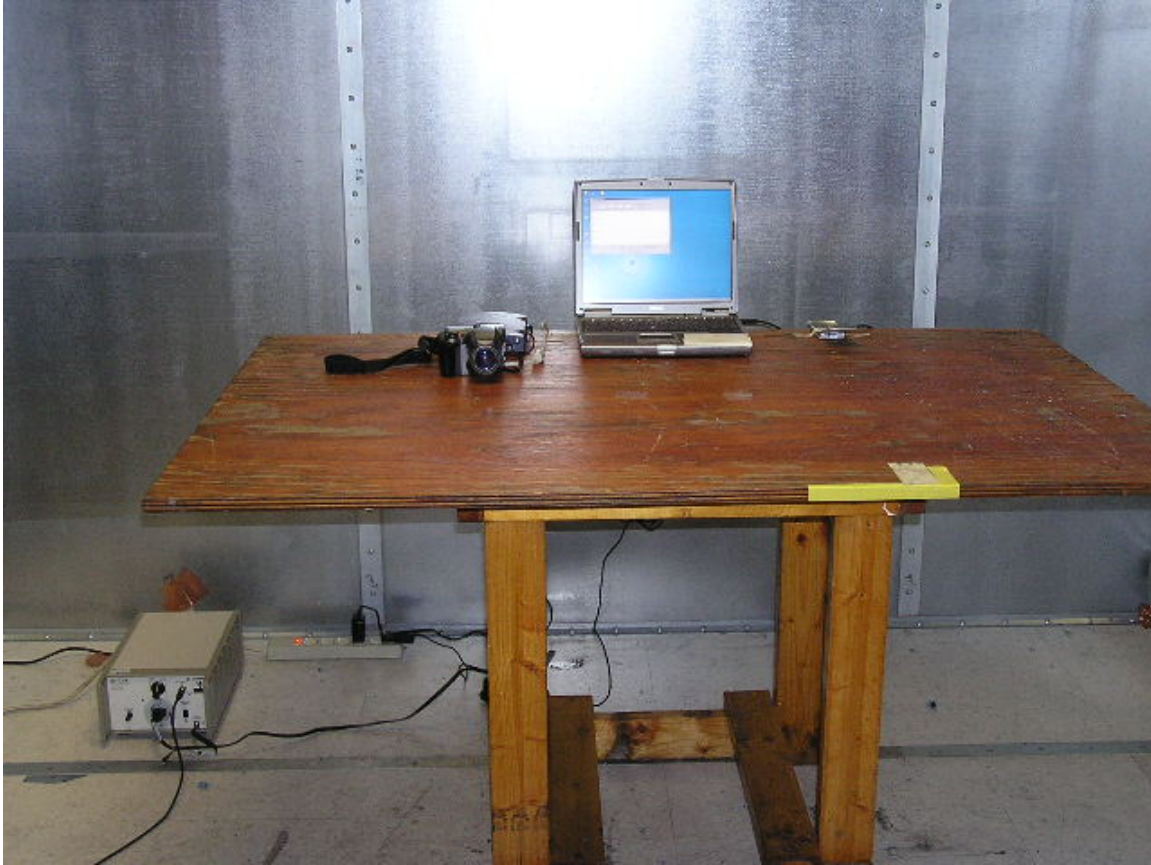
AC Line Conducted Emissions Measurement Setup. (Representative Photo- Not Actual Phone Tested)