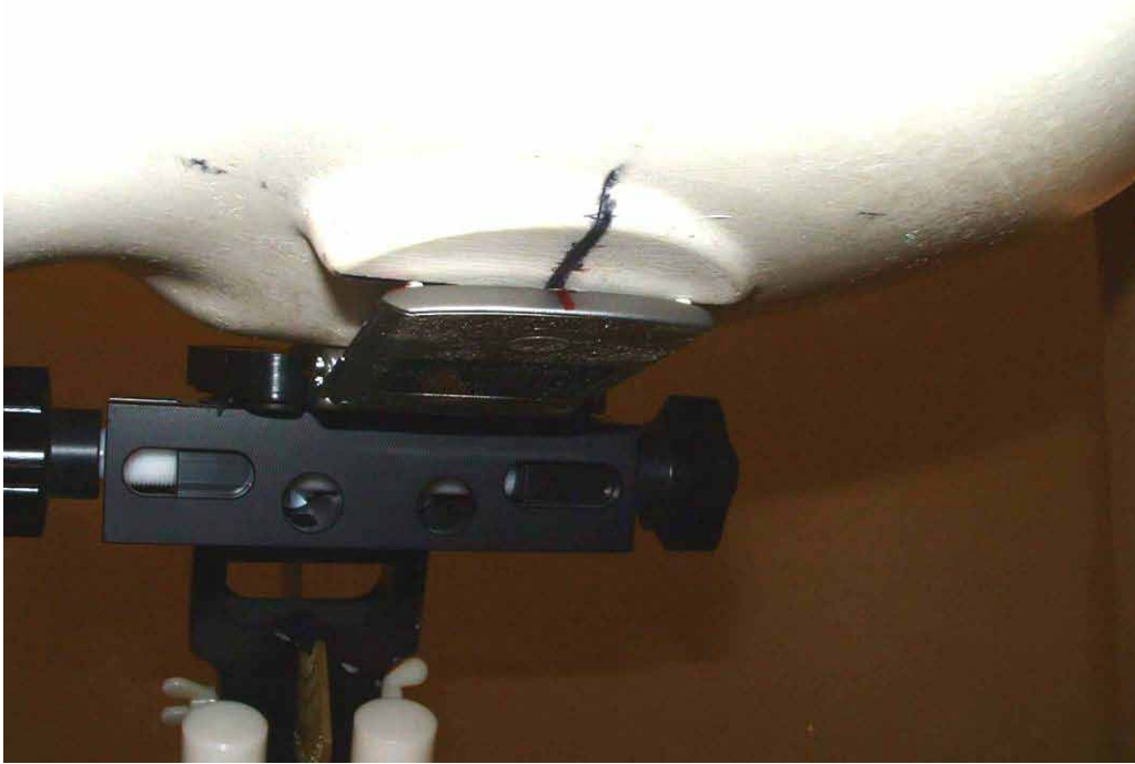
Figure 5. Rear View; Cheek/Touch Position