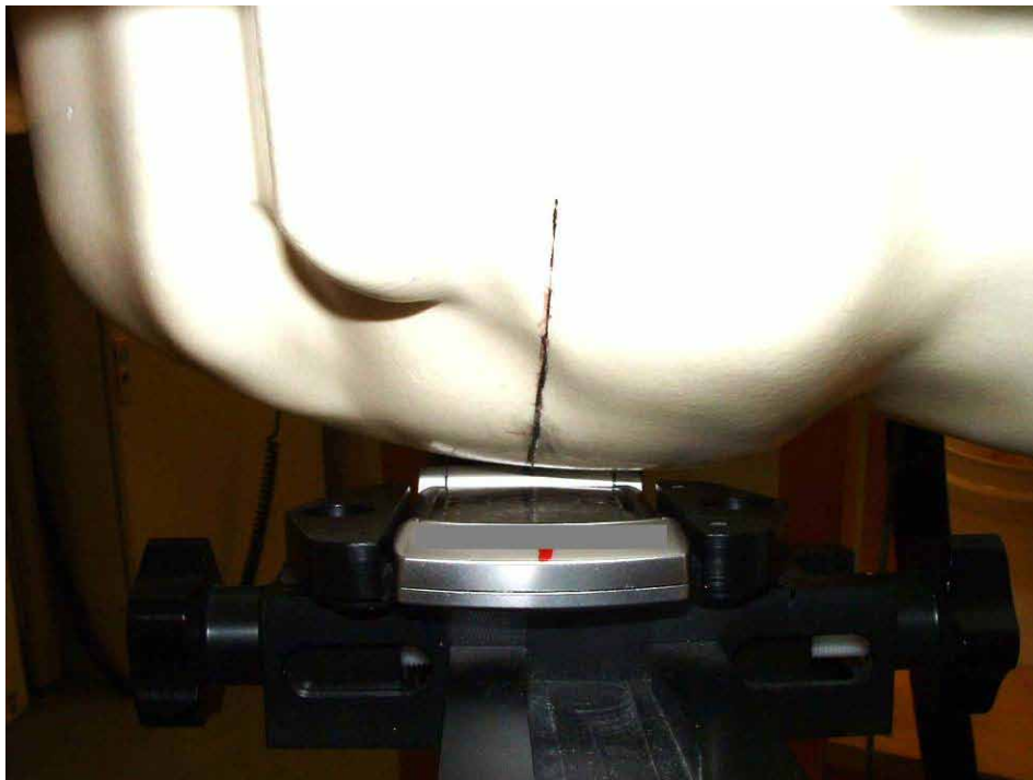
Figure 4. Front View; Cheek/Touch Position