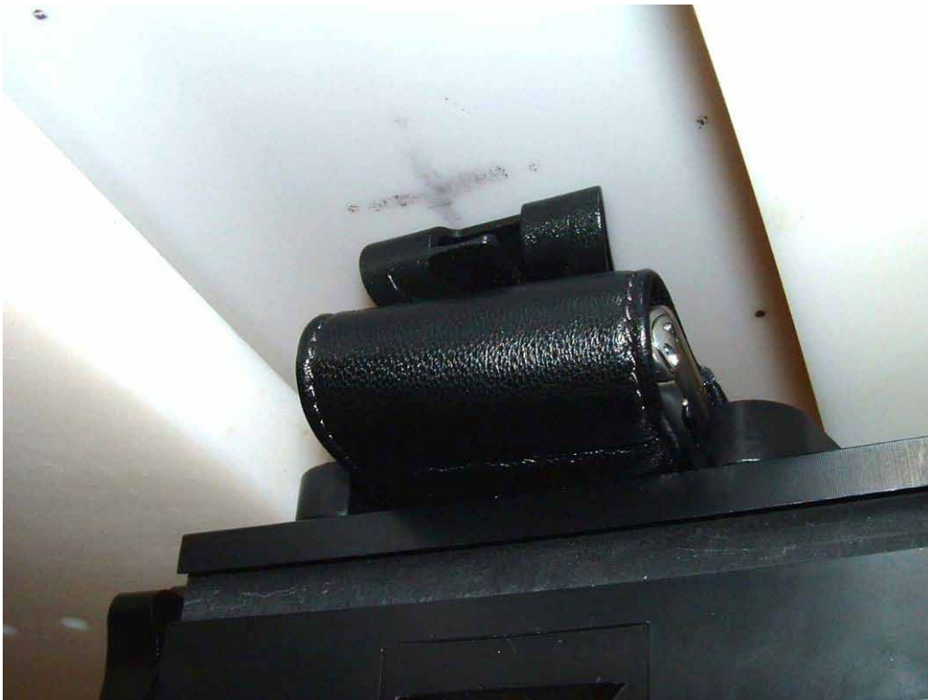
Figure 12. Body Worn Testing