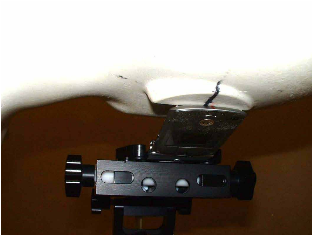
Figure 7. Rear View; Tilt Position