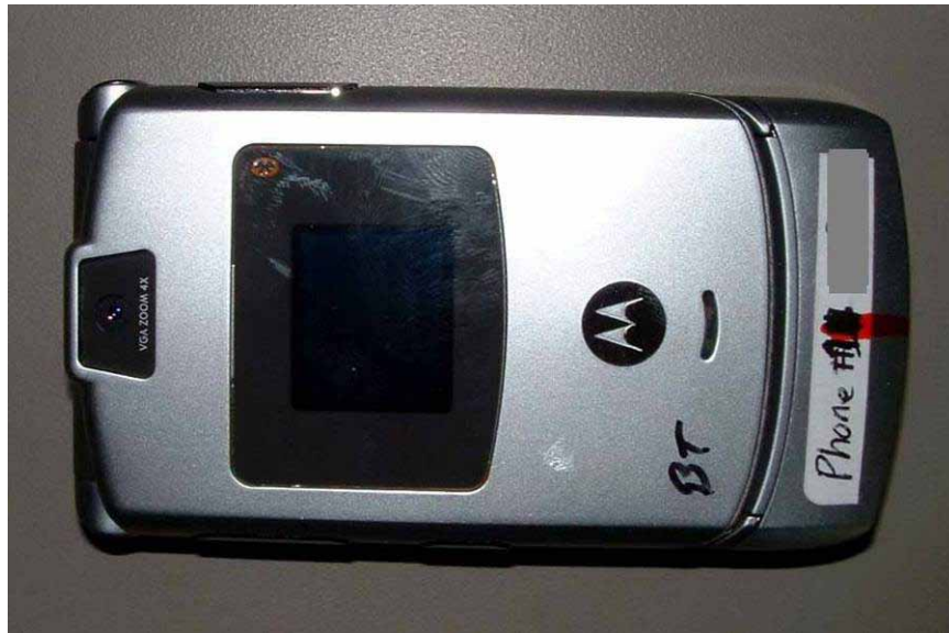
Figure 1. Front of Phone