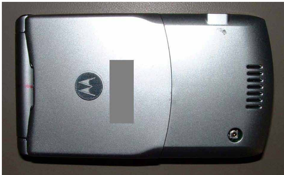
Figure 2. Back of Phone