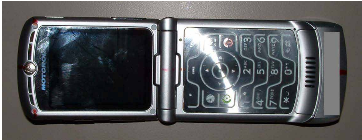
Figure 3. Phone Open