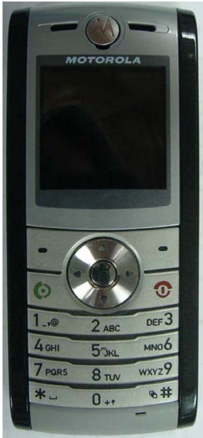
FRONT OF PHONE