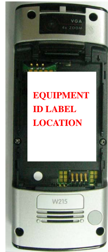
BACK OF PHONE WITH BATTERY COVER REMOVED