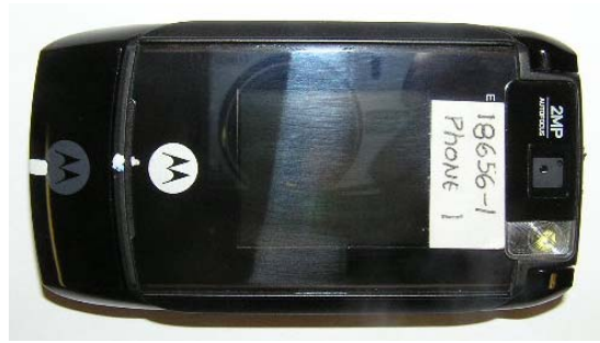
Figure A4-1. Phone Closed