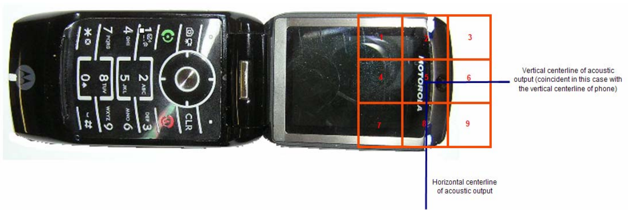
Figure A6-2. Phone Open - Orientation of Wireless Device and Measurement Plane