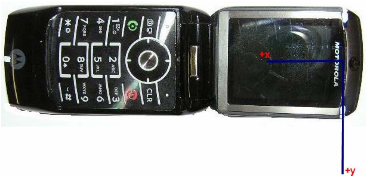
Figure A4-2. Phone Open – Coordinate Axis for T-coil Measured Point Location