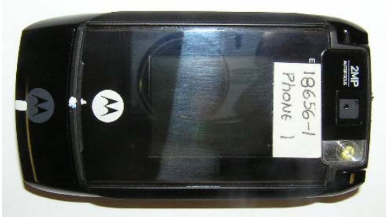
Figure A6-1. Phone Closed