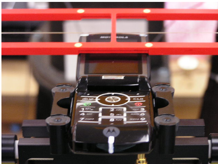
Figure A6-3. Views from the front