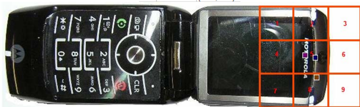
Figure A4-3. Phone Open – 5cm x 5cm grid for Near Field Measurements and T-coil Measured Point locations