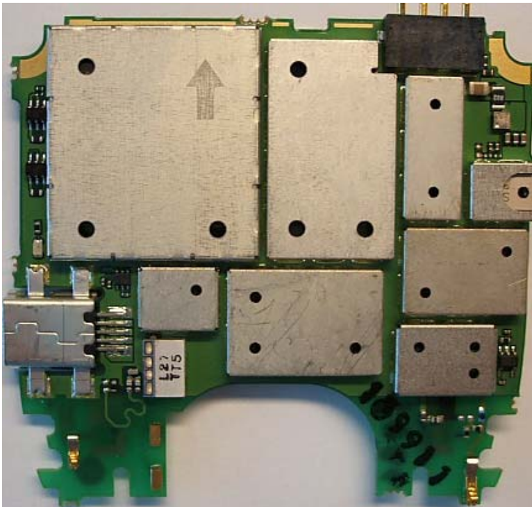
Main Board, Side B, With Shields