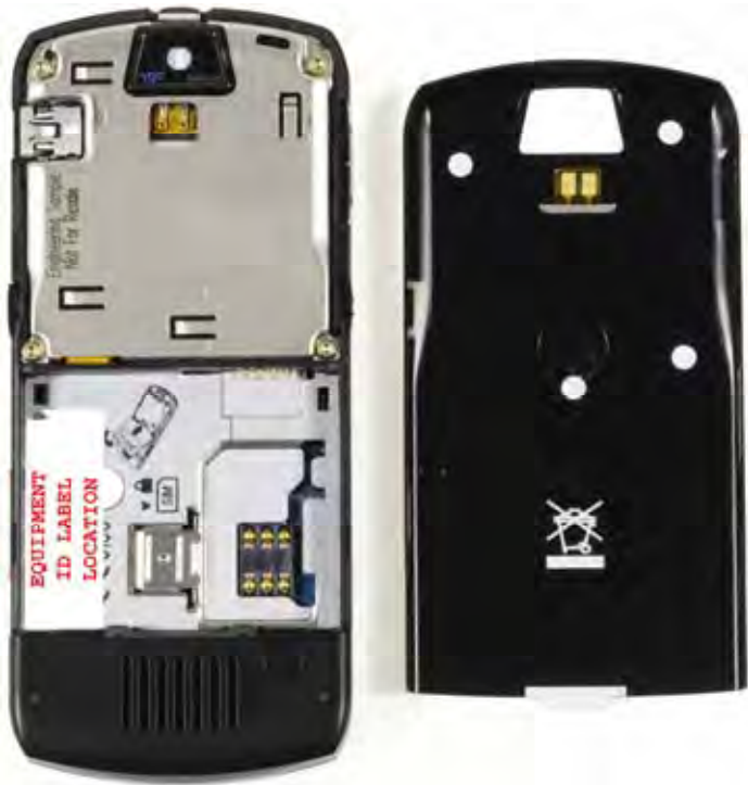
Antenna and PCB connections