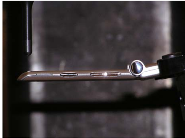
Figure A4-1. Views from the side