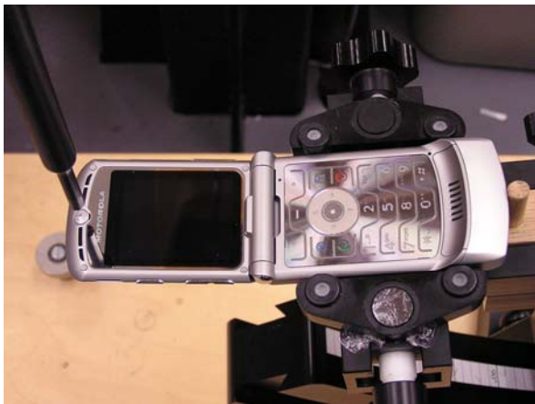
Figure A4-2. Views from above