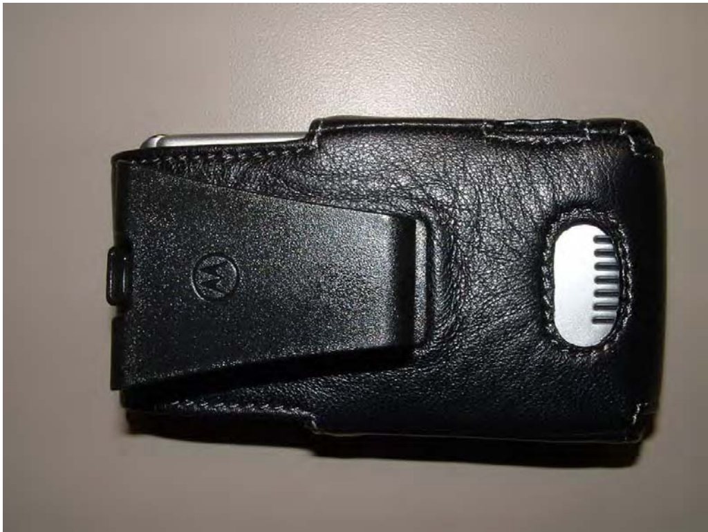
Figure 20. Back View; SYN1066A Case with SYN8631A Belt Clip