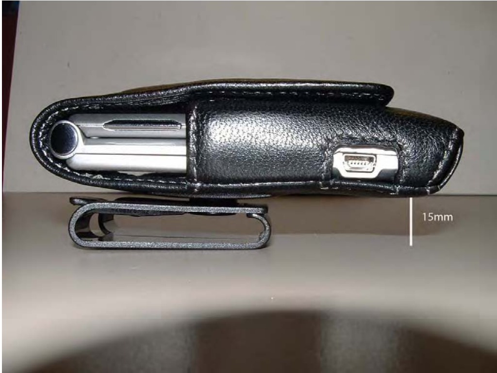
Figure 19. Side View; SYN1066A Case with SYN8631A Belt Clip