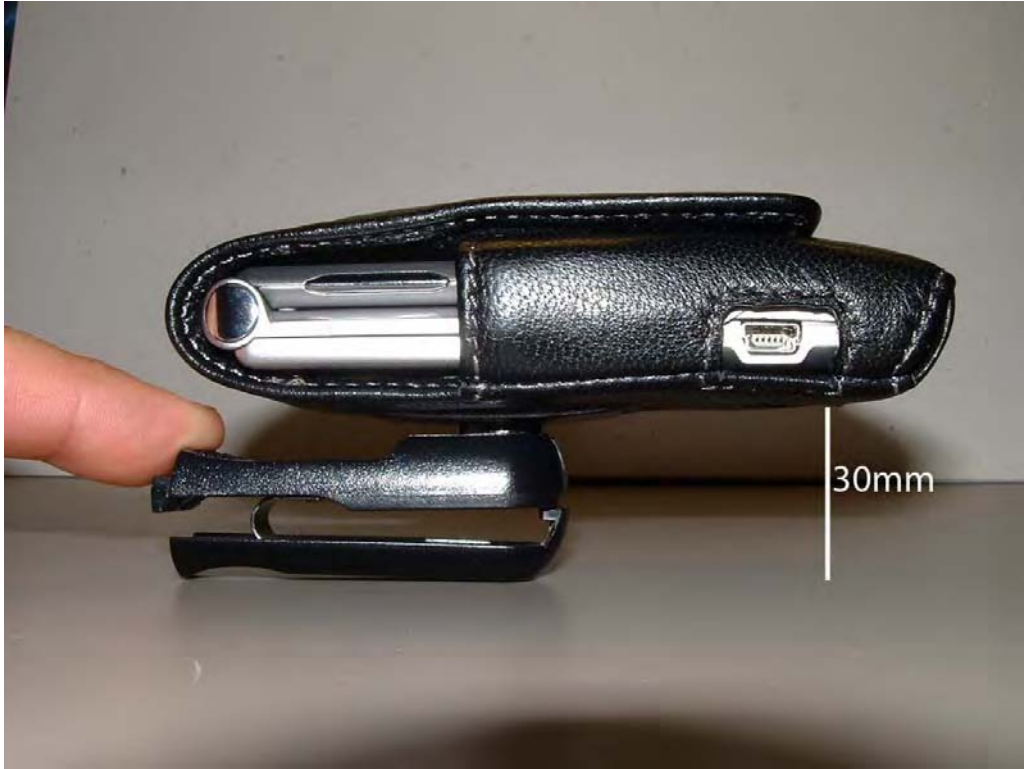
Figure 21. Side View; SYN1066A Case with SYN8763B Belt Clip