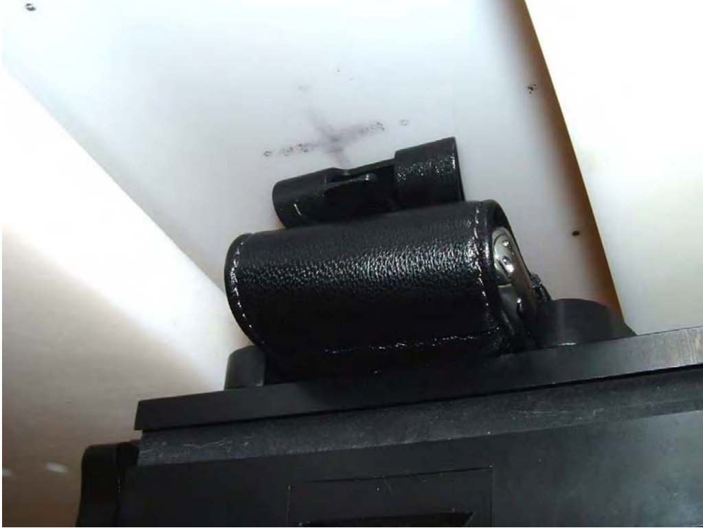
Figure 23. Body Worn Testing