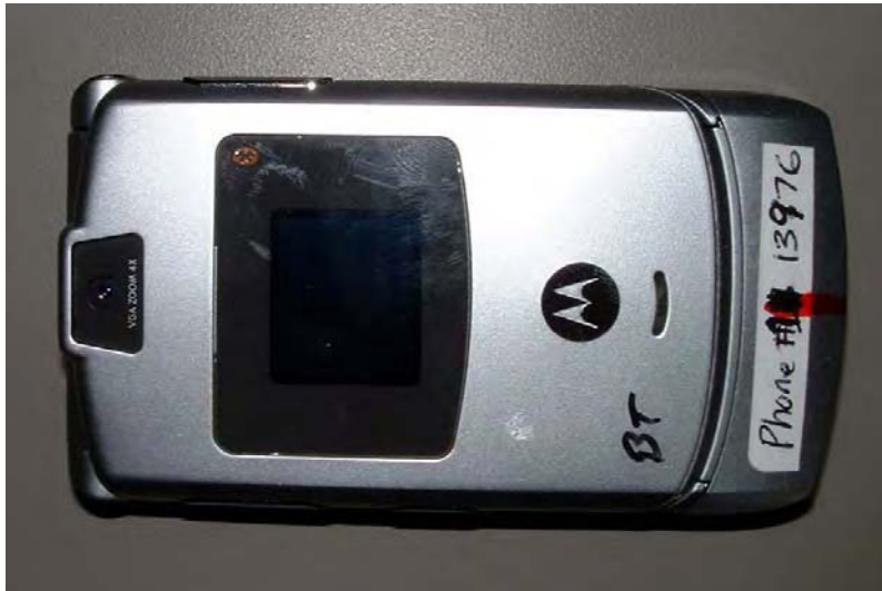
Figure 12. Front of Phone