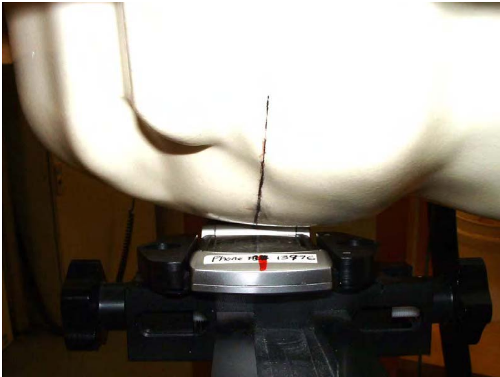
Figure 15. Front View; Cheek/Touch Position