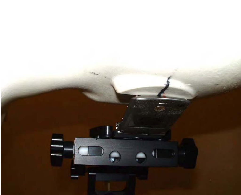
Figure 18. Rear View; Tilt Position