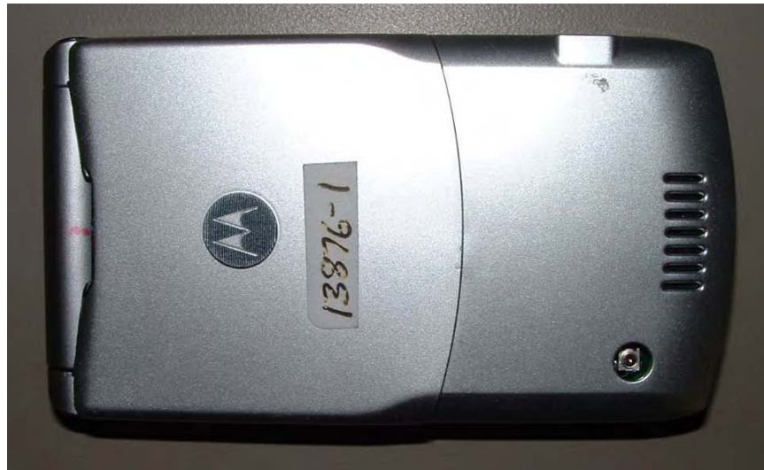
Figure 13. Back of Phone