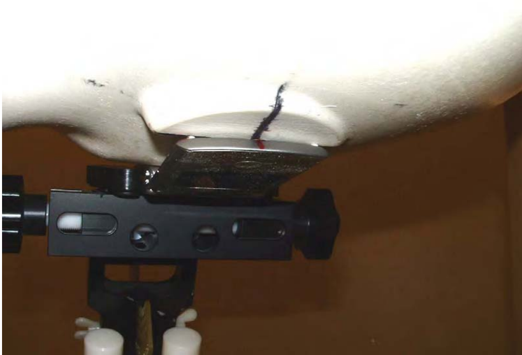
Figure 16. Rear View; Cheek/Touch Position