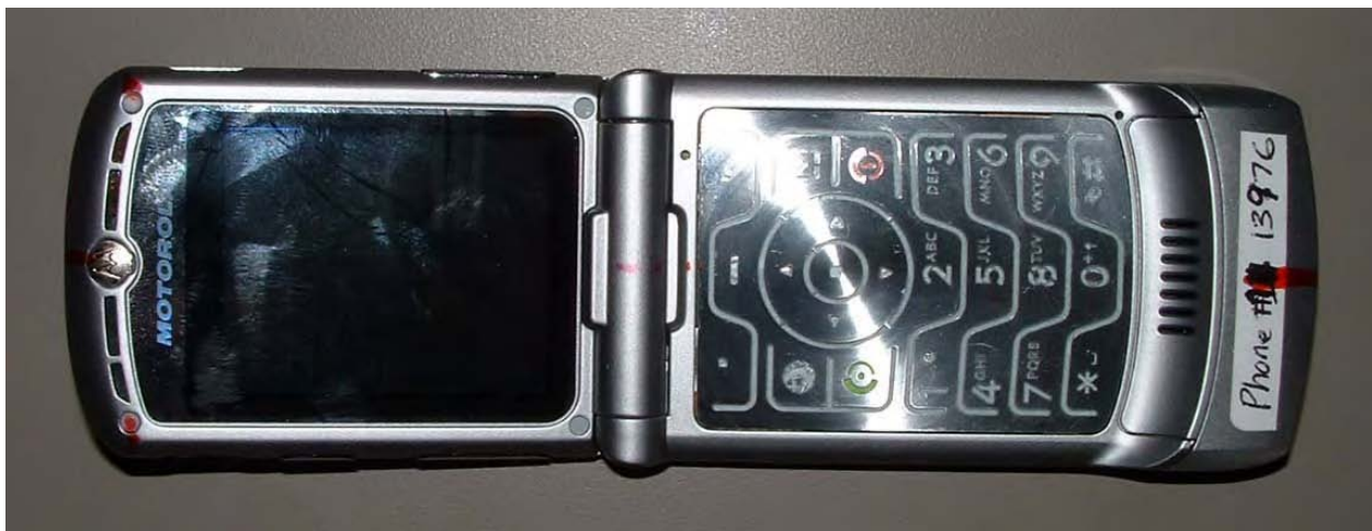
Figure 14. Phone Open