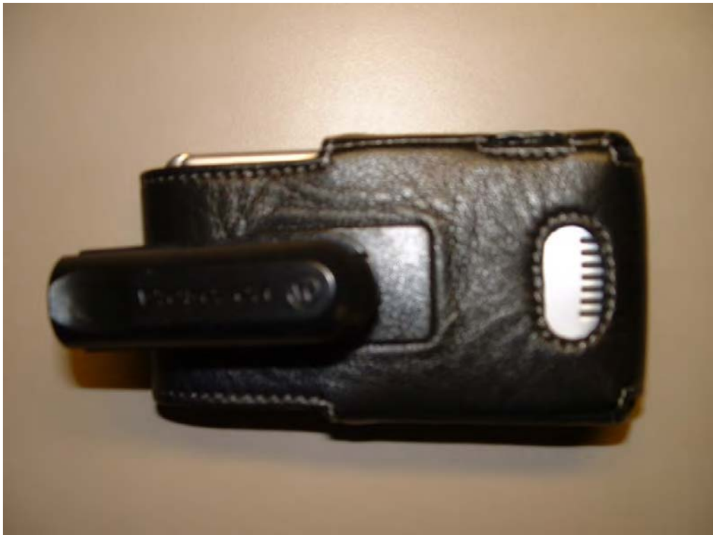
Figure 22. Back View; SYN1066A Case with SYN8763B Belt Clip