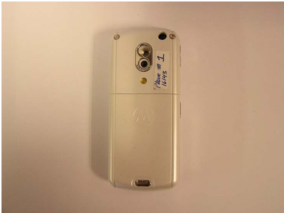
Figure 2. Back of Phone