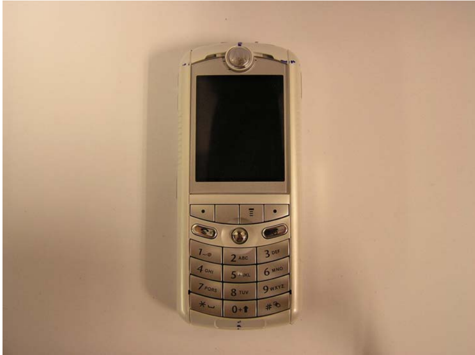
Figure 1. Front of Phone