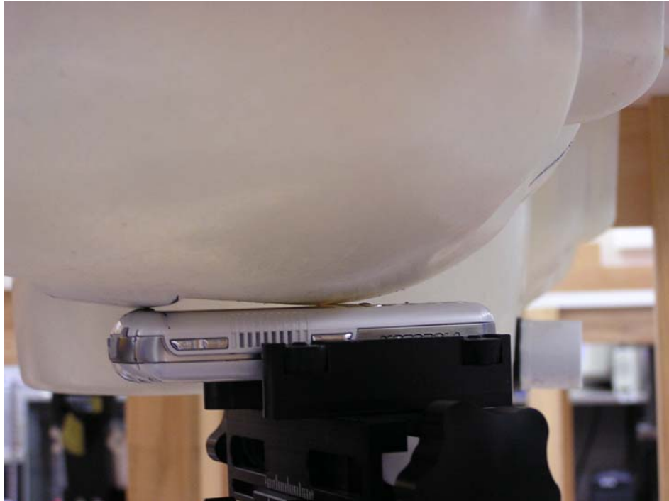
Figure 3. Phone Against the Head Phantom (Cheek Touch)