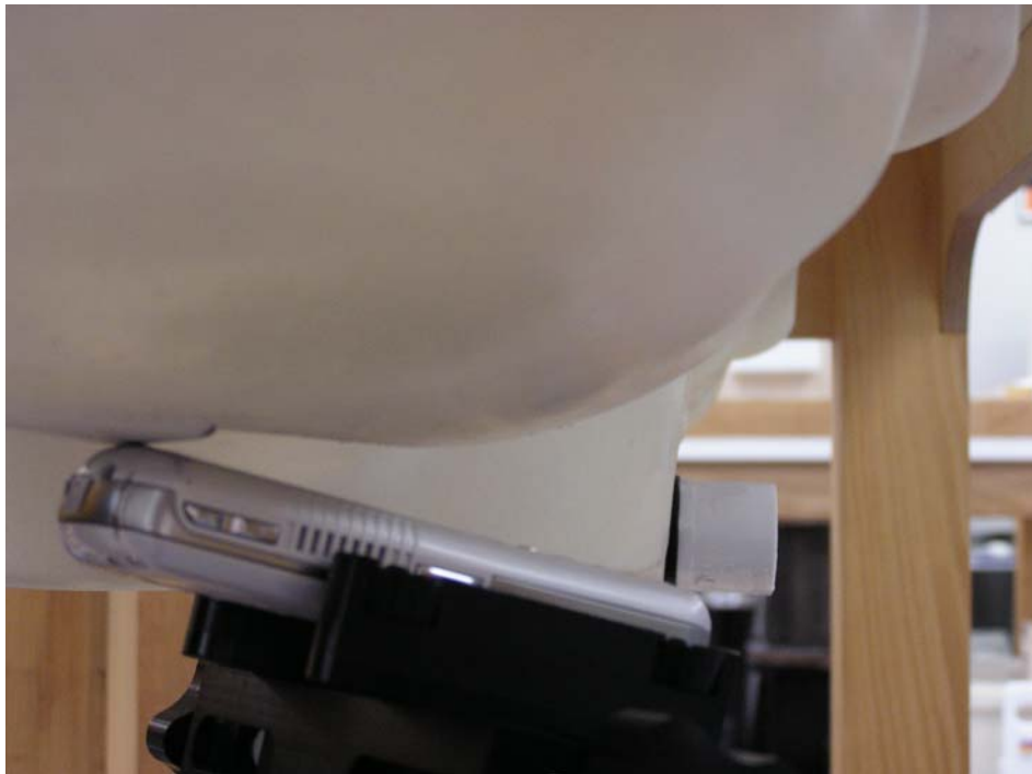
Figure 4. Phone Against the Head Phantom (15°Tilt)