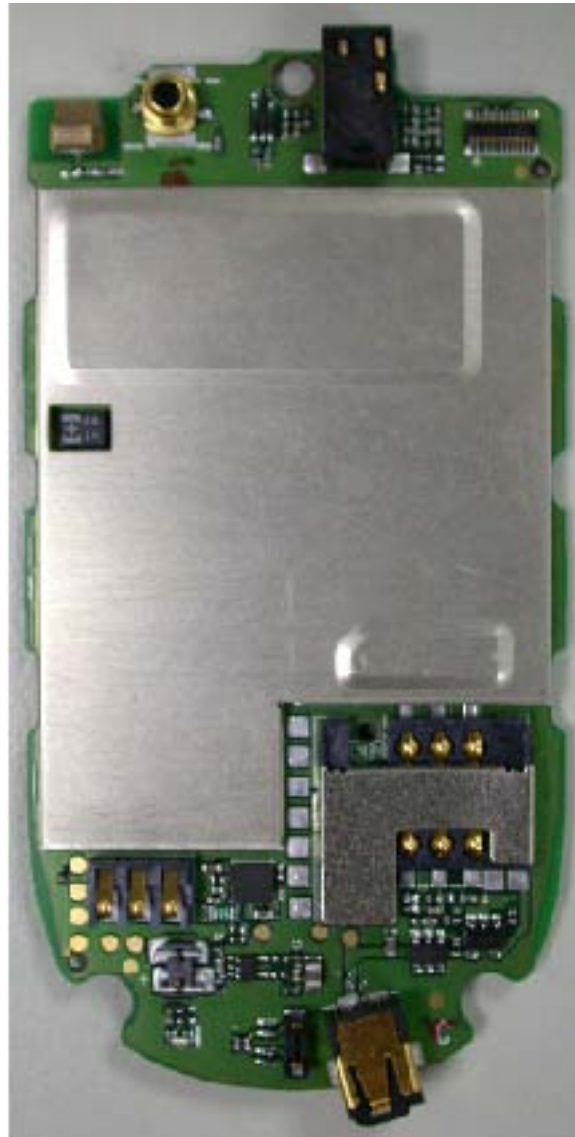
Main Board Rear View