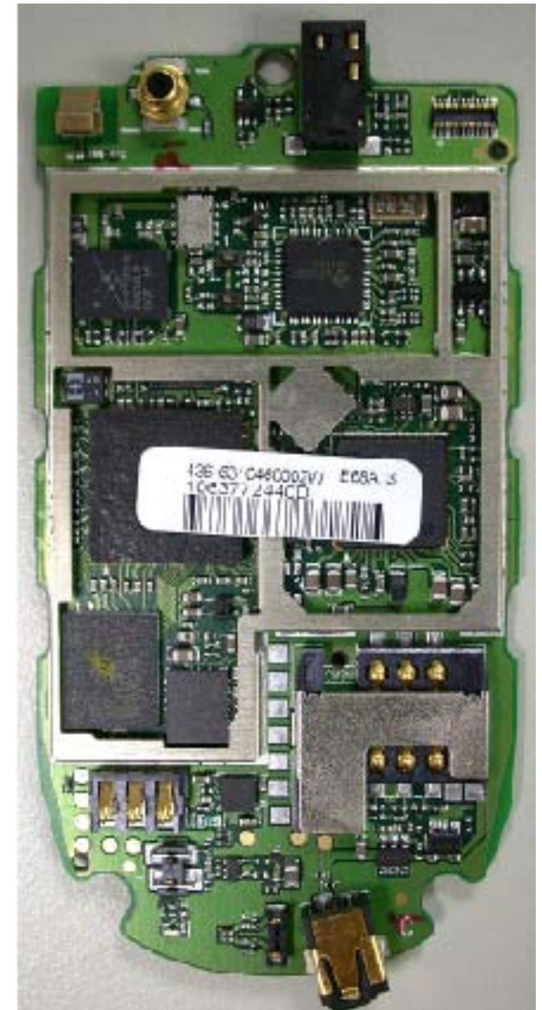
Main Board Shield Removed