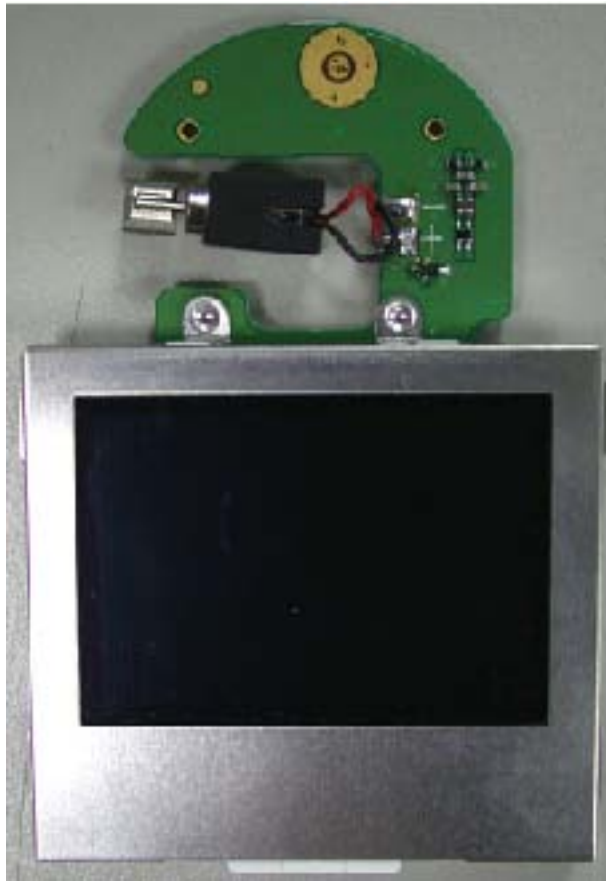
Sub Board Front View