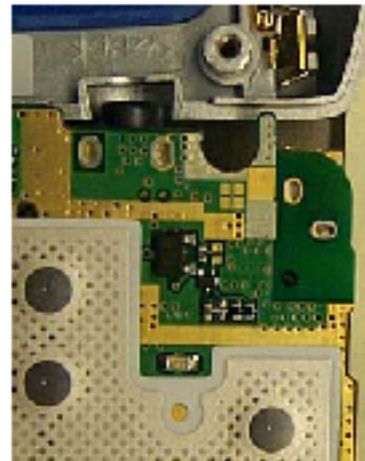
Class II PCB showing flip hinge

Please contact me by telephone at (847) 523-6167, or by e-mail ( A.Bachler@motorola.com ), if there are questions or additional information needed concerning this filing.