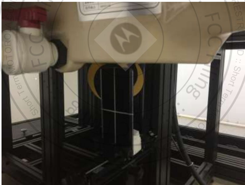
Top Side (5mm)