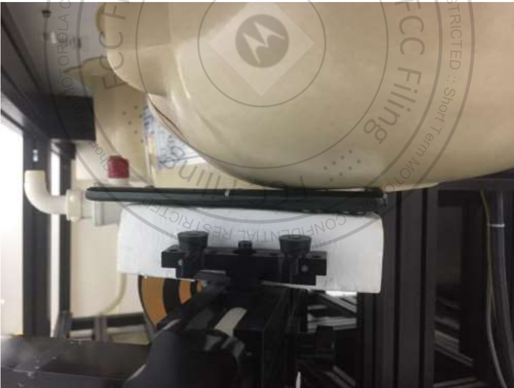
Left Check (0mm)