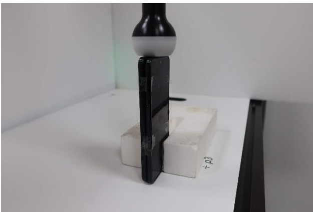
Top Edge test at 0cm