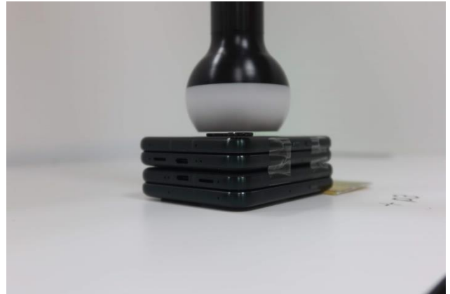
Back test at 0cm