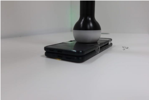
Front test at 0cm