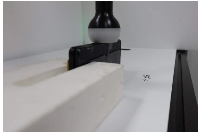
Right Edge test at 0cm