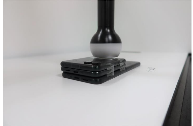
Back_client phone lid be closed test at 0cm