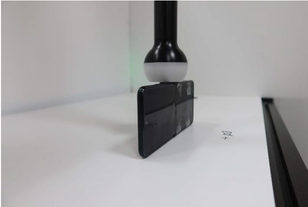
Right Edge_client phone lid be closed test at 0cm