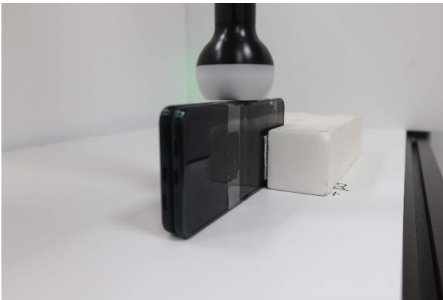
Left Edge test at 0cm