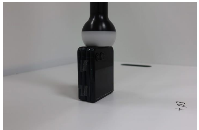
Bottom Edge test at 0cm