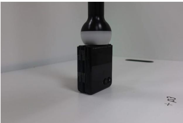
Top Edge test at 0cm