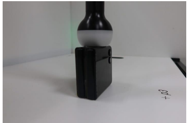
Right Edge test at 0cm