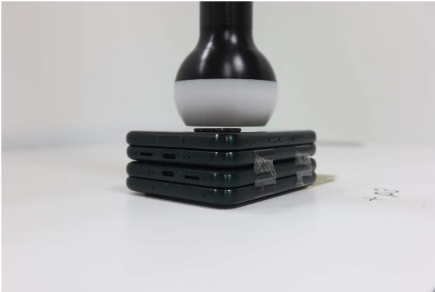
Front test at 0cm