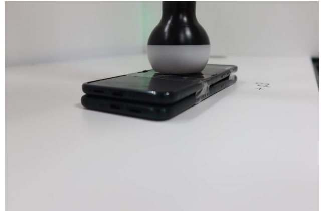
Back test at 0cm