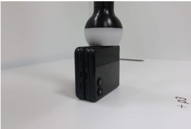
Left Edge test at 0cm