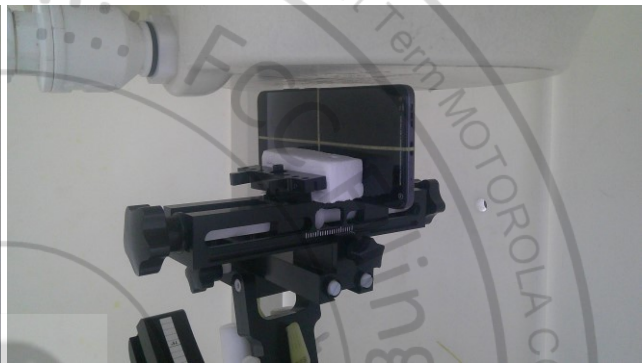
Right Side, Test Separation 5 mm