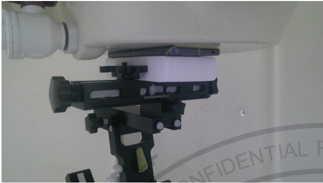
Front, Test Separation 0 mm