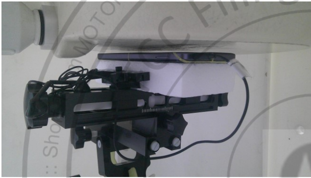
Back with headset, Test Separation 5 mm