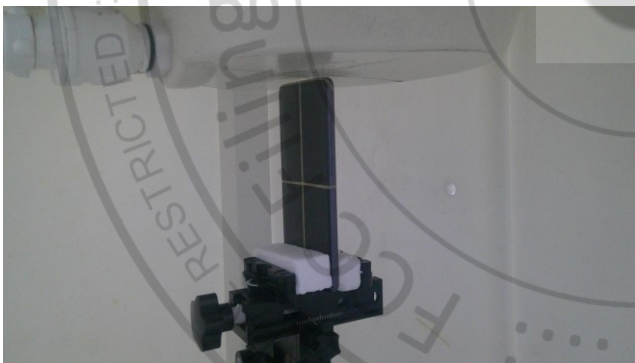
Top Side, Test Separation 5 mm