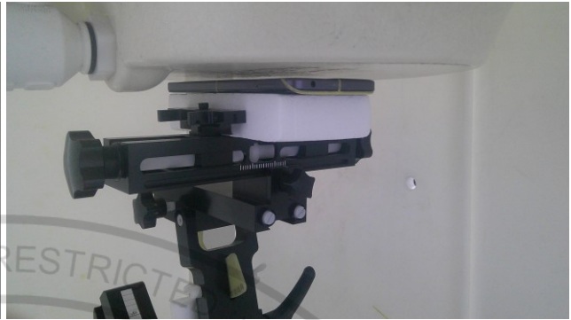
Back, Test Separation 5 mm