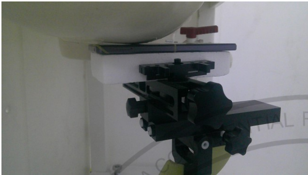
Right Cheek, Test Separation 0 mm