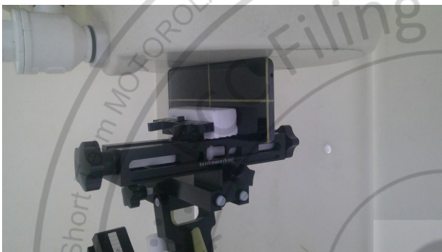
Left Side, Test Separation 0 mm