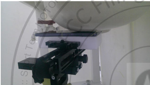
Left Cheek, Test Separation 0 mm