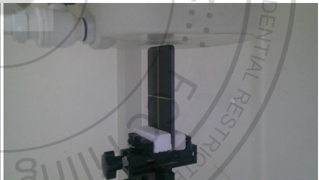
Bottom Side, Test Separation 5 mm