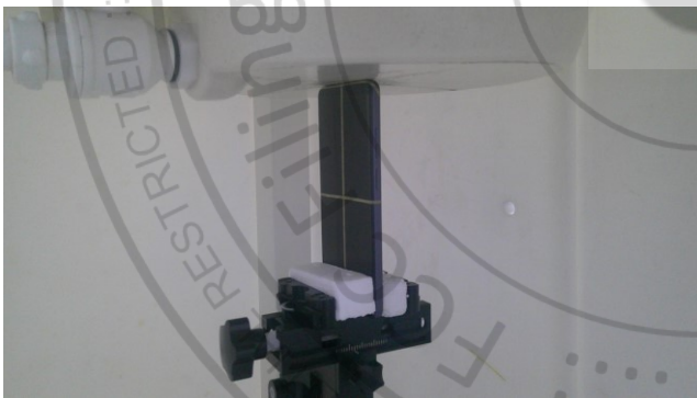
Top Side, Test Separation 0 mm