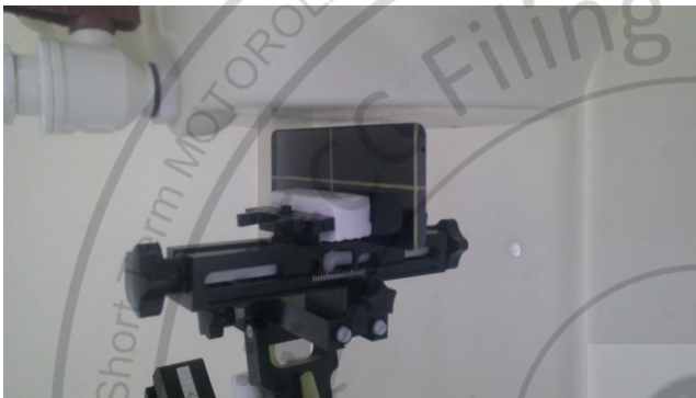
Left Side, Test Separation 5 mm