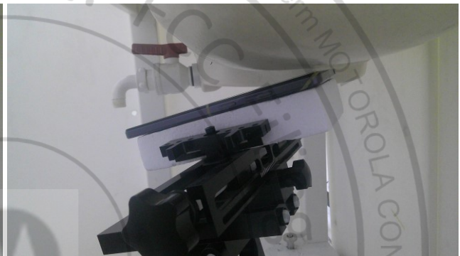
Left Tilted, Test Separation 0 mm