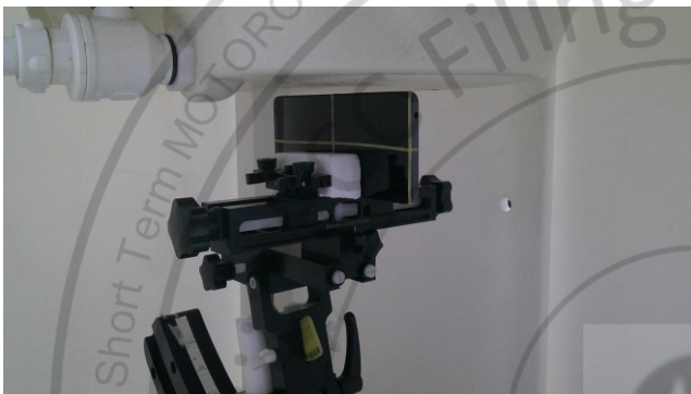
Left Side, Test Separation 7 mm