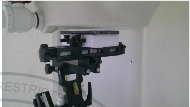
Back, Test Separation 7 mm