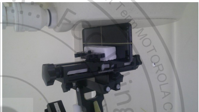
Right Side, Test Separation 0 mm