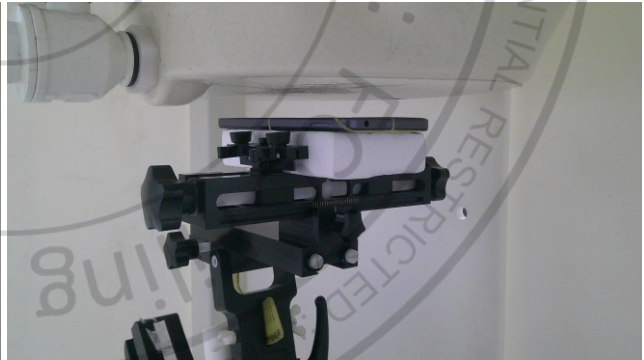
Back, Test Separation 20 mm