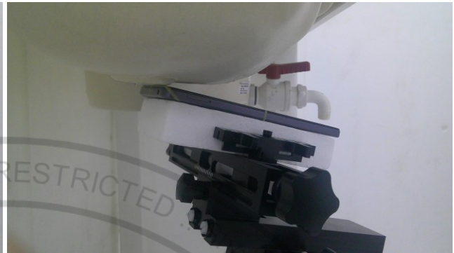
Right Tilted, Test Separation 0 mm