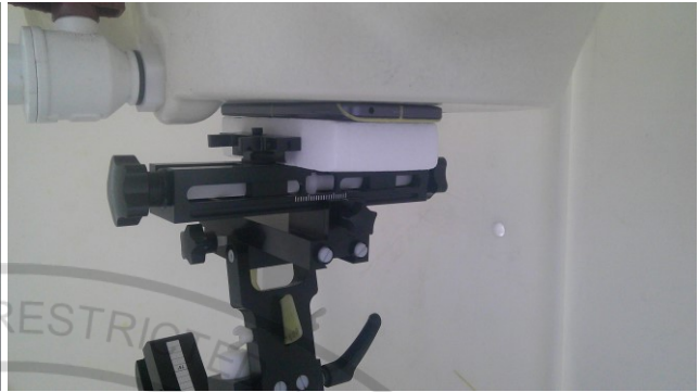
Back, Test Separation 0 mm