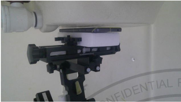
Front, Test Separation 5 mm