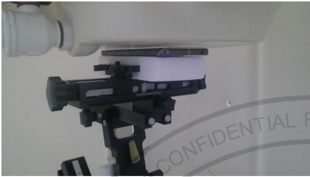
Front, Test Separation 5 mm