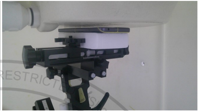
Back, Test Separation 5 mm