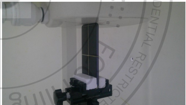
Bottom Side, Test Separation 0 mm