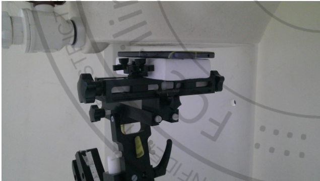
Front, Test Separation 9 mm