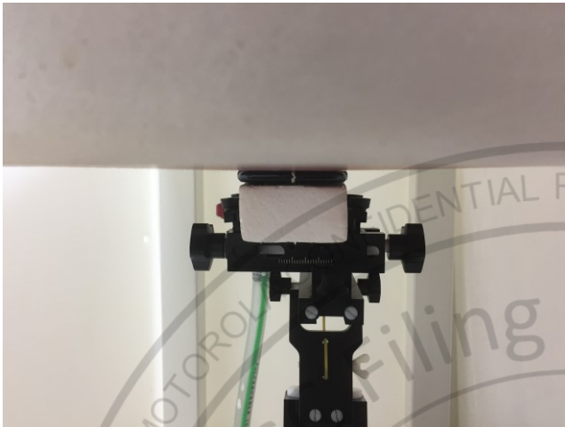
Front, Test Separation 0 mm