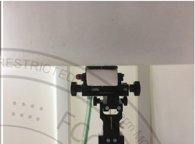
Back, Test Separation 0 mm