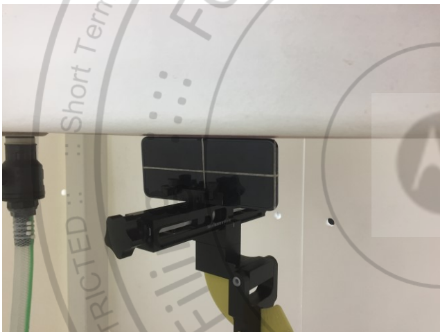
Left Side, Test Separation 0 mm