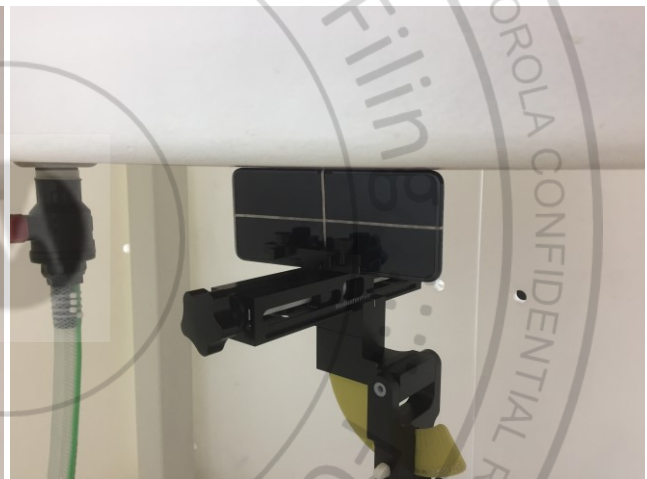
Right Side, Test Separation 0 mm