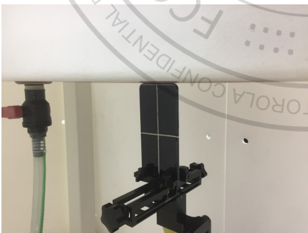
Top Side, Test Separation 0 mm