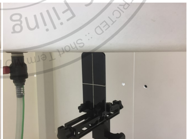
Bottom Side, Test Separation 0 mm