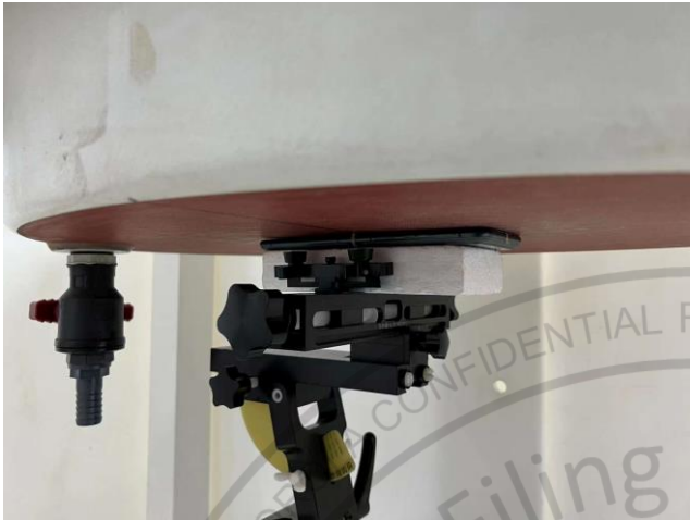
Front, Test Separation 0 mm