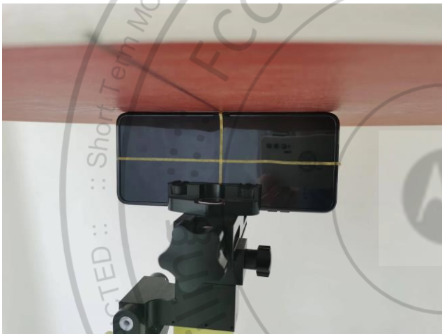
Left Side, Test Separation 0 mm