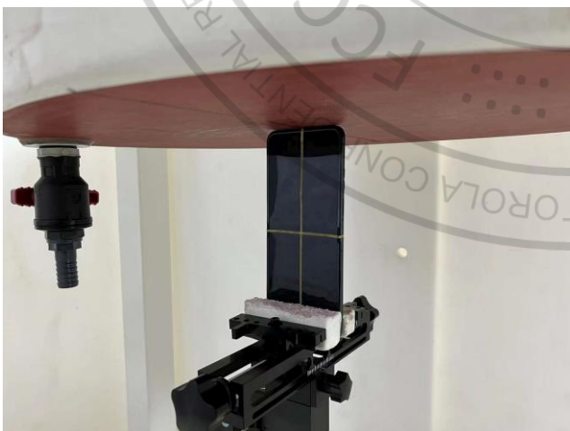
Top Side, Test Separation 0 mm