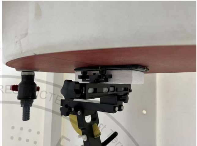
Back, Test Separation 0 mm