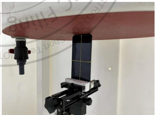
Bottom Side, Test Separation 0 mm