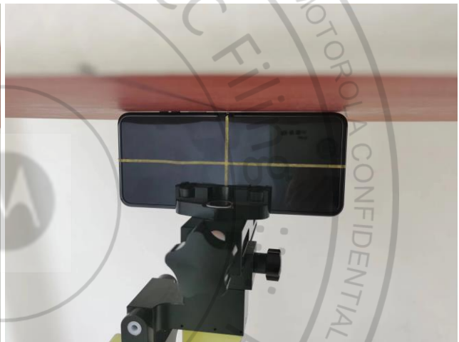
Right Side, Test Separation 0 mm