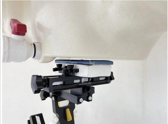
Back, Test Separation 5 mm