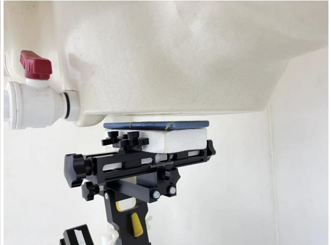
Front, Test Separation 10 mm