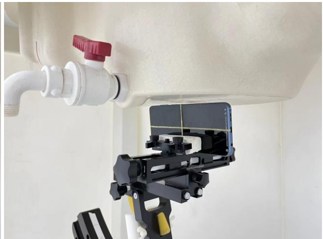
Right Side, Test Separation 5 mm