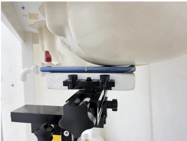
Left Cheek, Test Separation 0 mm