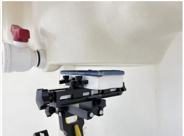
Back, Test Separation 13 mm