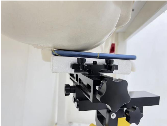
Right Cheek, Test Separation 0 mm