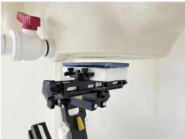
Front, Test Separation 14 mm