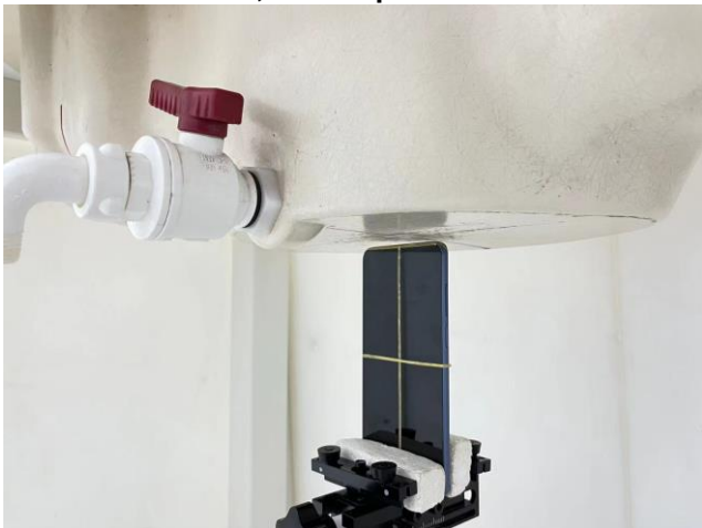
Top Side, Test Separation 5 mm