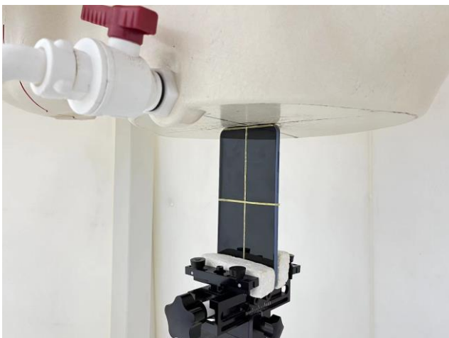
Top Side, Test Separation 0 mm