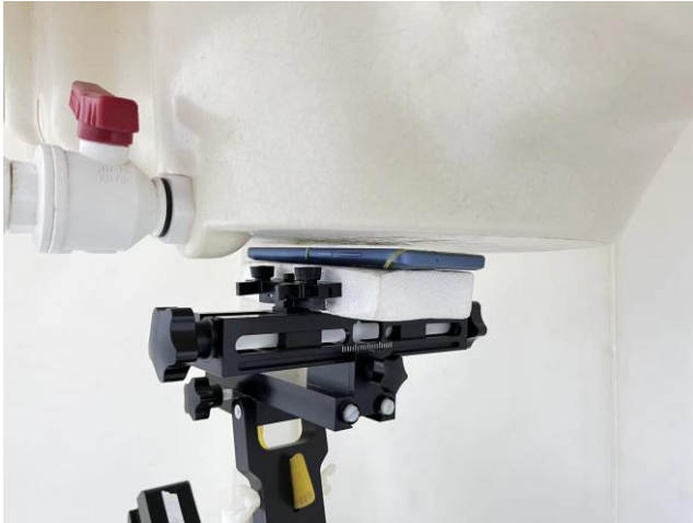
Front, Test Separation 5 mm