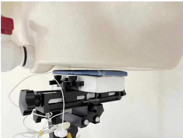
Back, with headset, Test Separation 5 mm