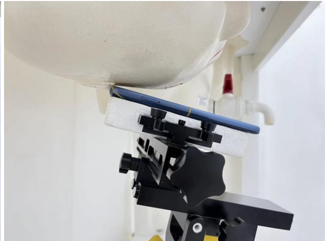
Right Tilted, Test Separation 0 mm