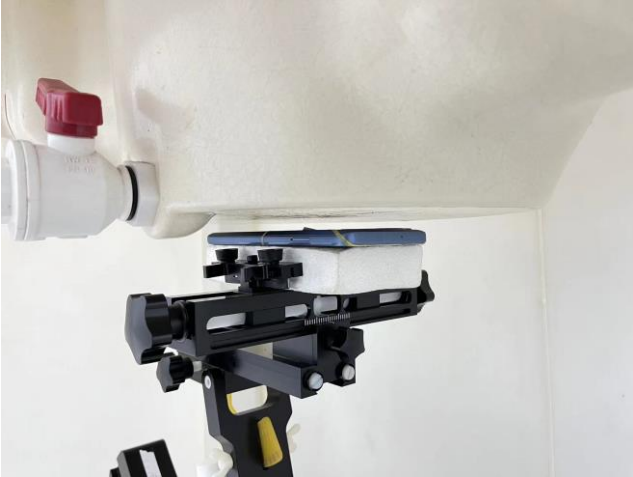
Back, Test Separation 11 mm