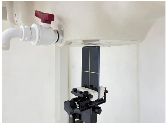
Bottom Side, Test Separation 7 mm