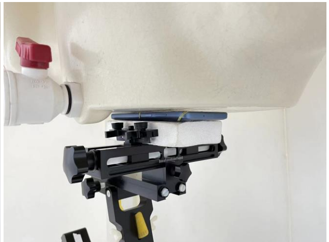
Front, Test Separation 1 mm