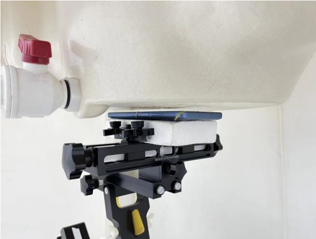
Front, Test Separation 7 mm