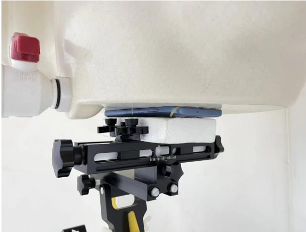
Front, Test Separation 0 mm