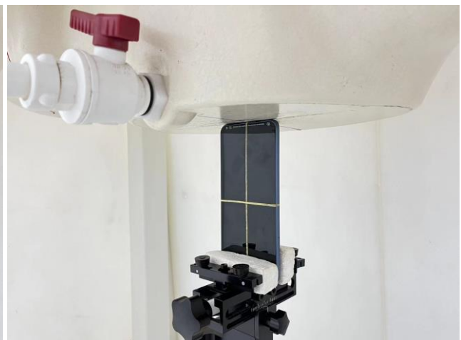
Bottom Side, Test Separation 0 mm