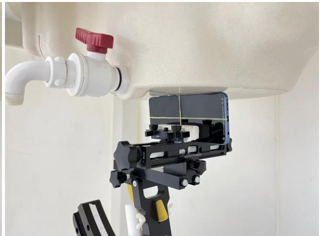
Right Side, Test Separation 0 mm