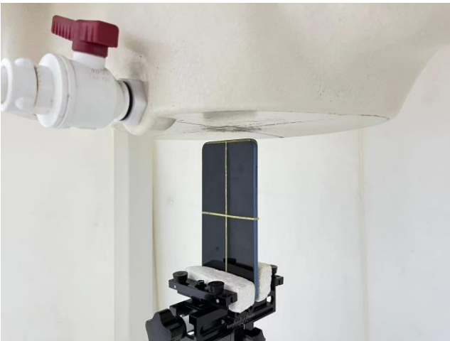
Top Side, Test Separation 11 mm