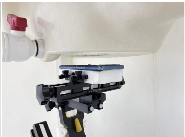
Back, Test Separation 24 mm