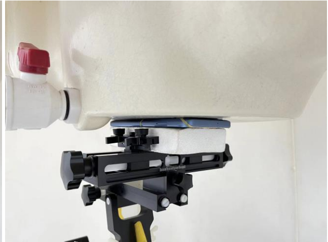
Back, Test Separation 0 mm