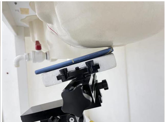
Left Tilted, Test Separation 0 mm