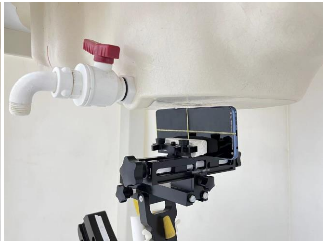
Right Side, Test Separation 6 mm