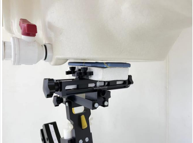
Back, Test Separation 4 mm