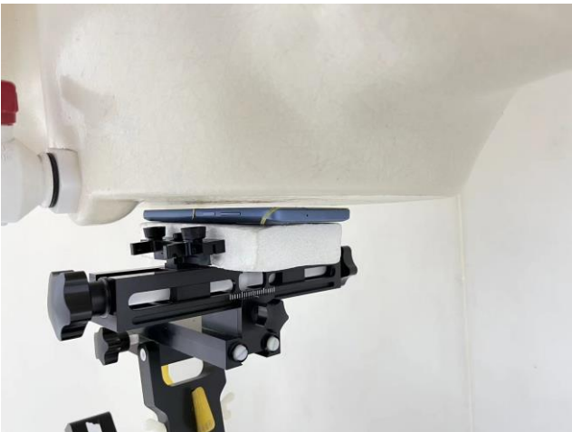
Front, Test Separation 6 mm