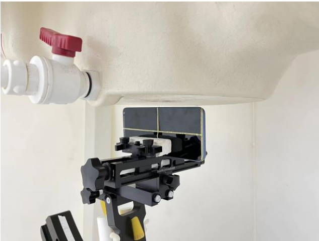
Left Side, Test Separation 10 mm