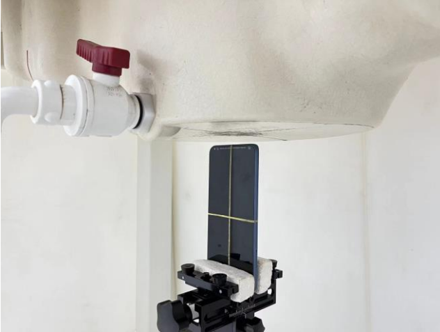
Bottom Side, Test Separation 12 mm