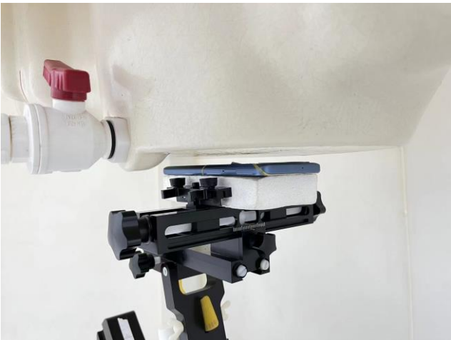
Back, Test Separation 12 mm