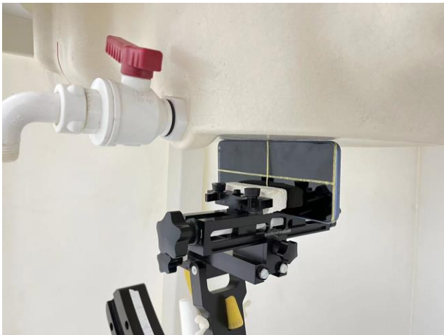
Left Side, Test Separation 0 mm