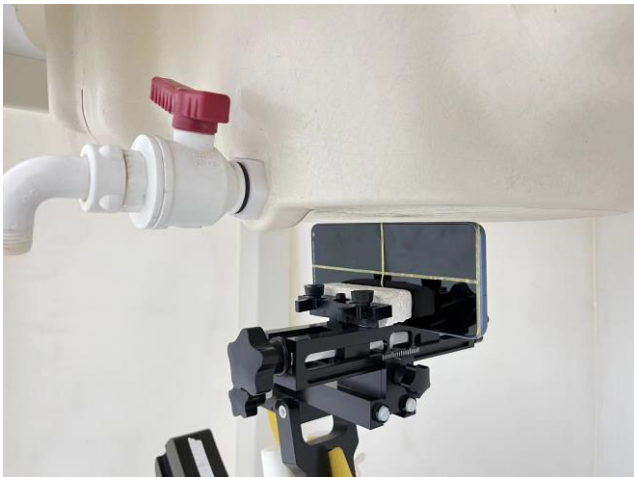
Left Side, Test Separation 5 mm