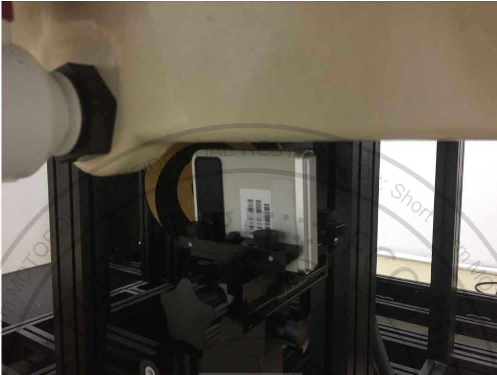
Left Side (5mm)