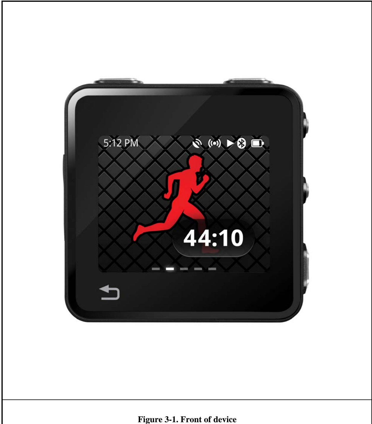
Figure 3-1. Front of device

The radio product shapes, colors and housings/bezels may vary.