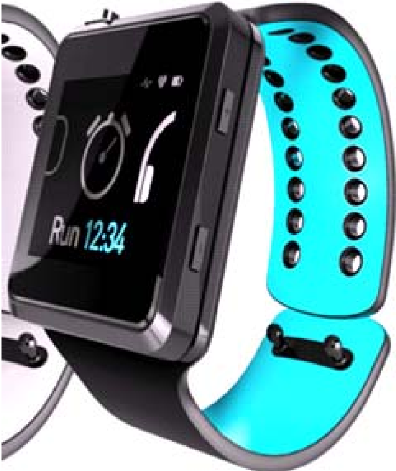
Figure 3-4. Device in Intended Use Configuration (Wrist Band)