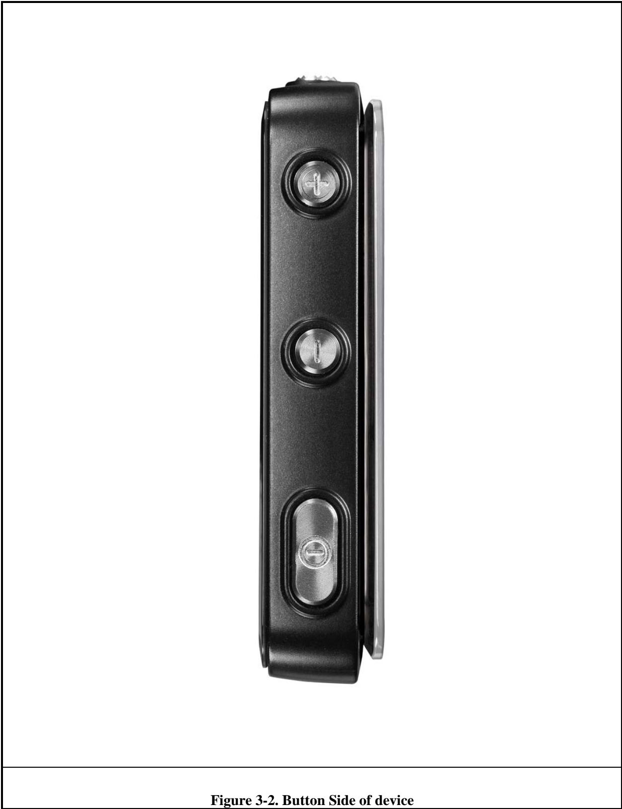
Figure 3-2. Button Side of device