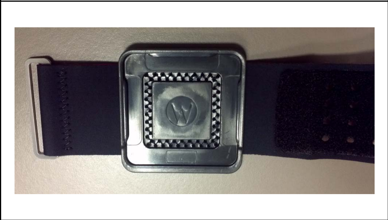
Figure 3-7. Details of Arm Band