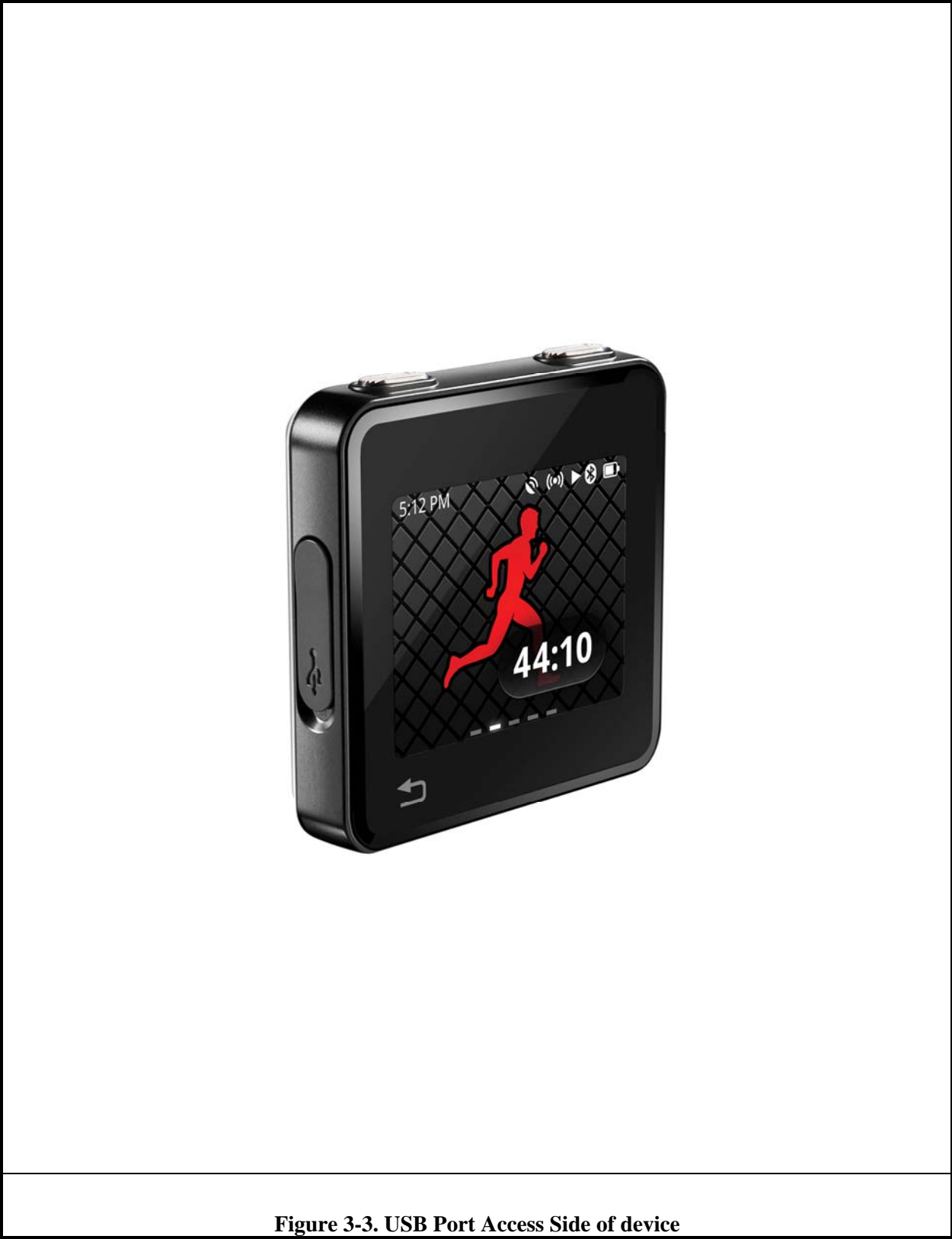
Figure 3-3. USB Port Access Side of device