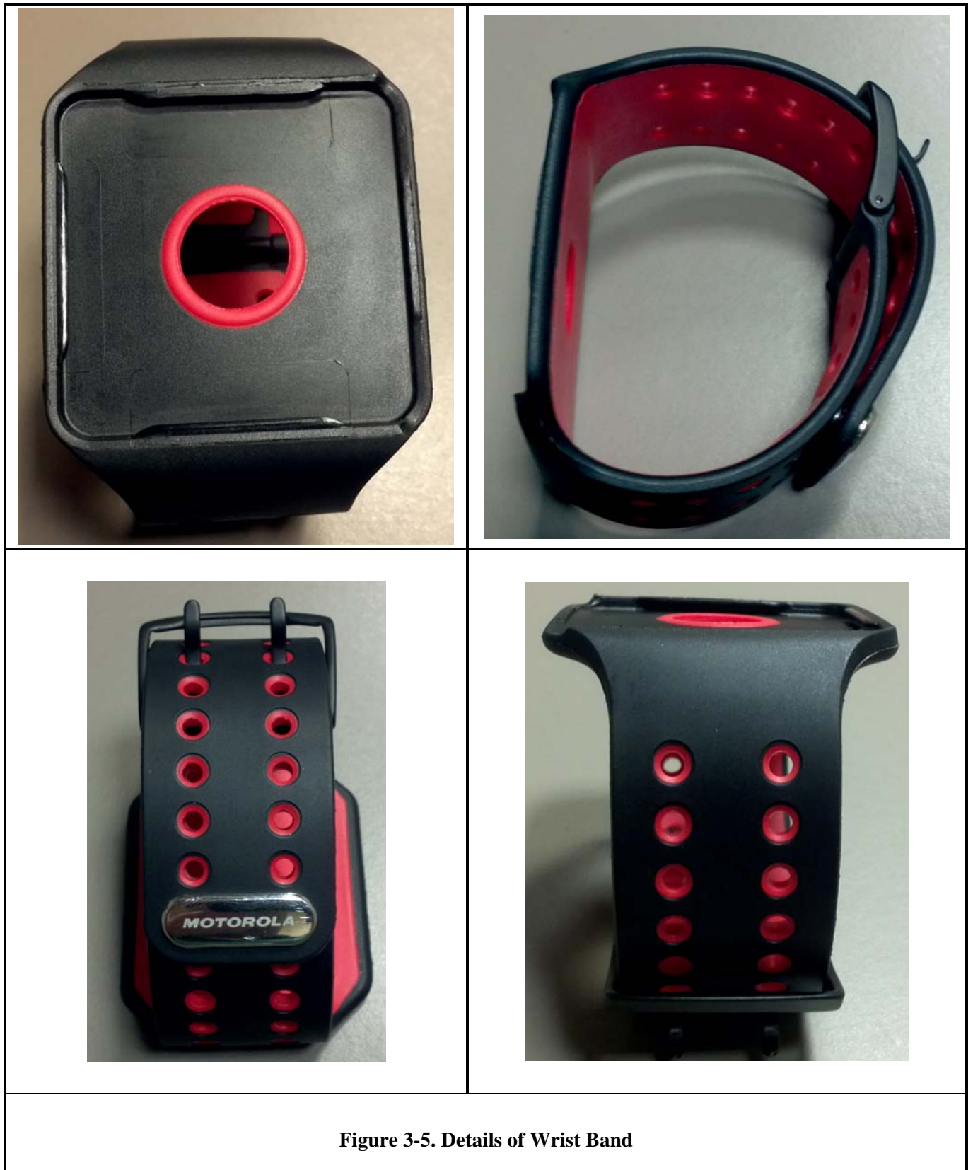
Figure 3-5. Details of Wrist Band