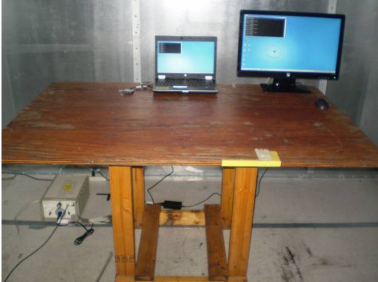
Figure 7c3-1: Test Configuration – AC Line (Part 15 Computing Device).