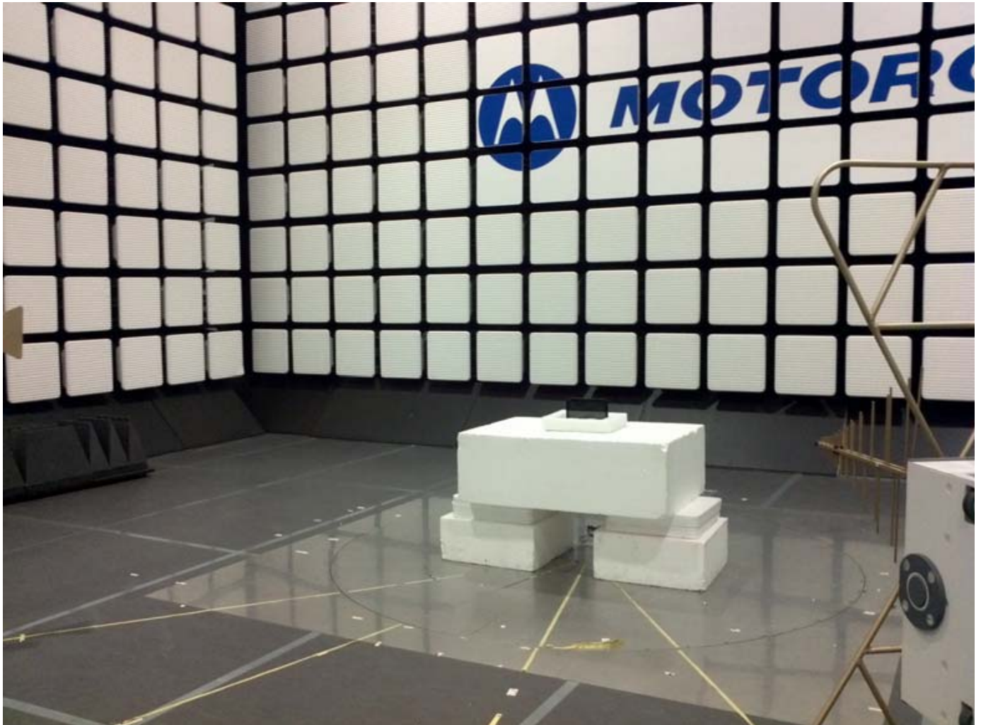
Figure 7c1-1: TX Radiated Emissions Configuration.