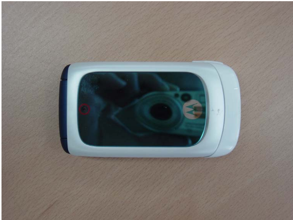
Figure 1: Front of Phone