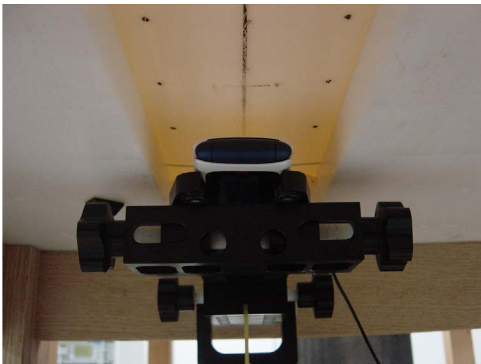
Figure 6: Phone Against the Flat Phantom