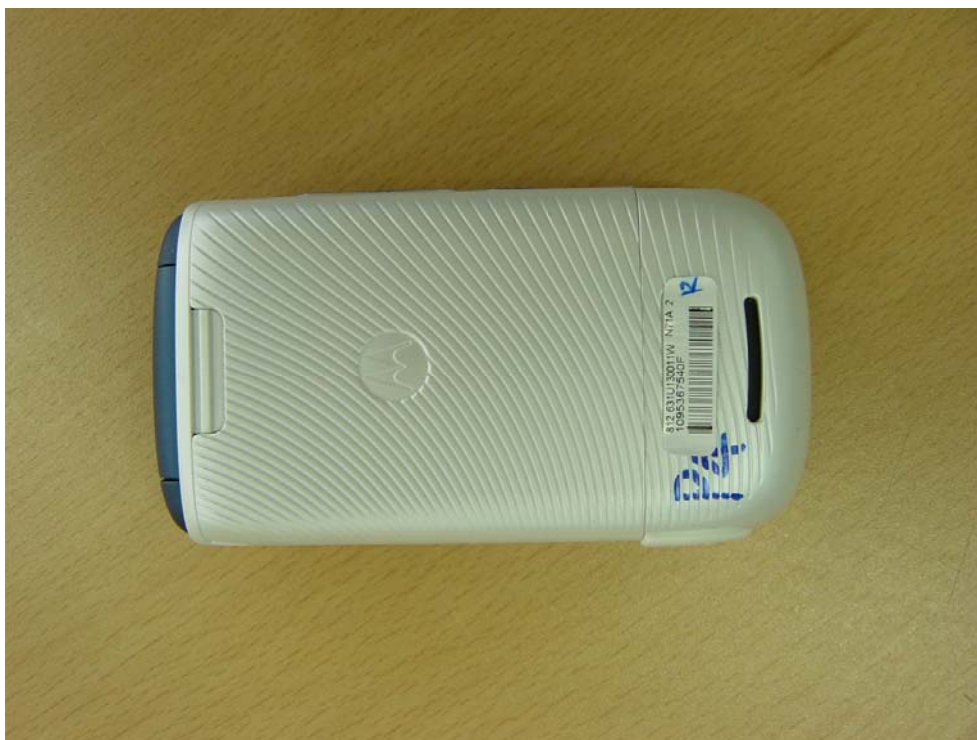
Figure 2: Back of Phone