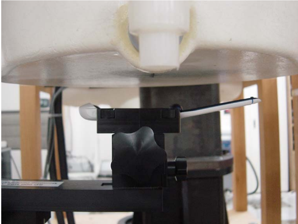
Figure 7: Push-to-Talk Position; Phone Against the Flat Phantom