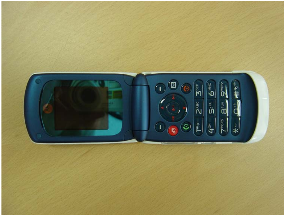
Figure 3: Phone Open