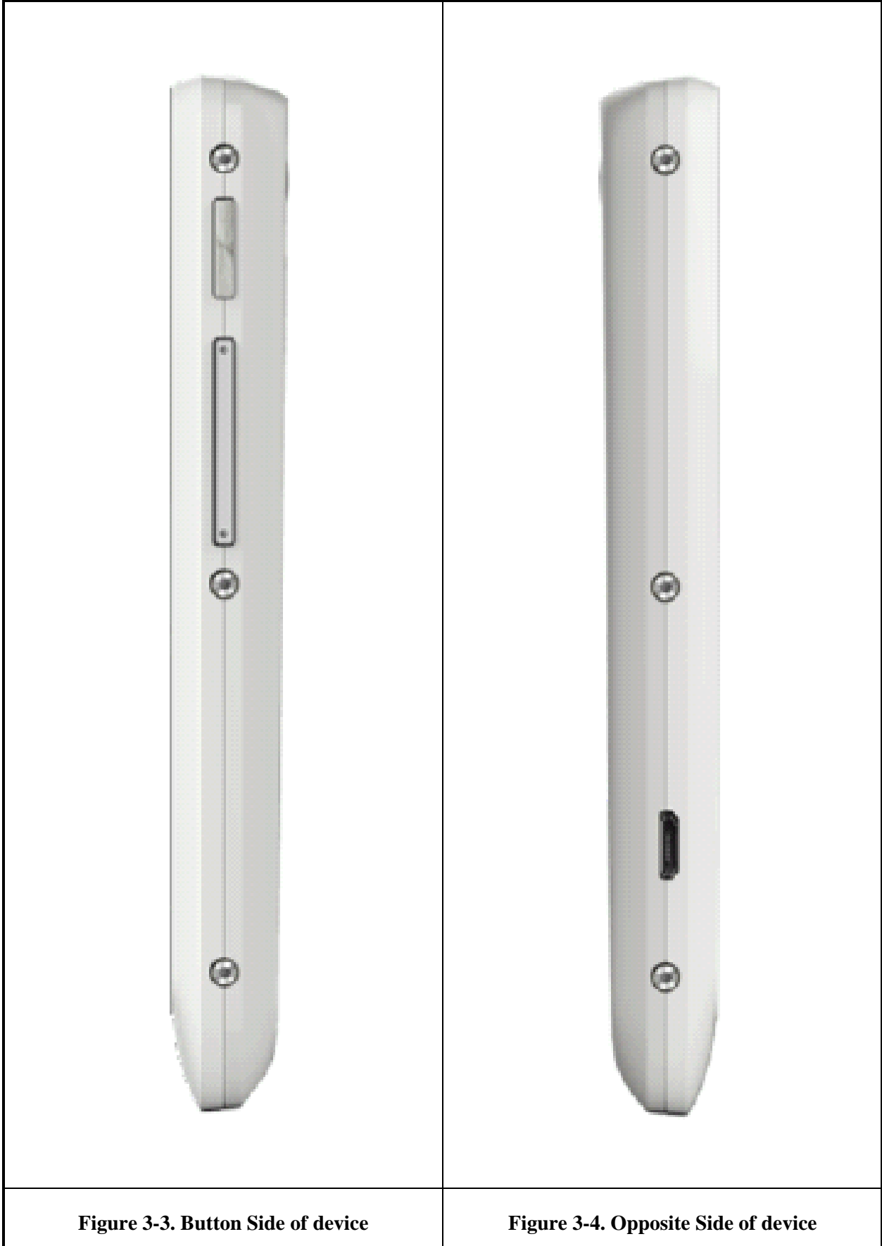
Figure 3-3. Button Side of device