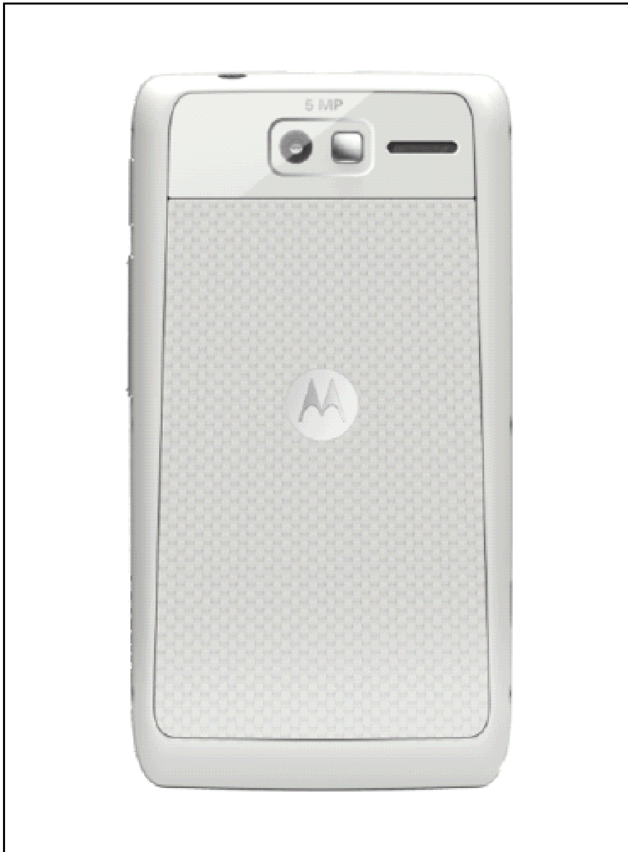
Figure 3-2. Back of device