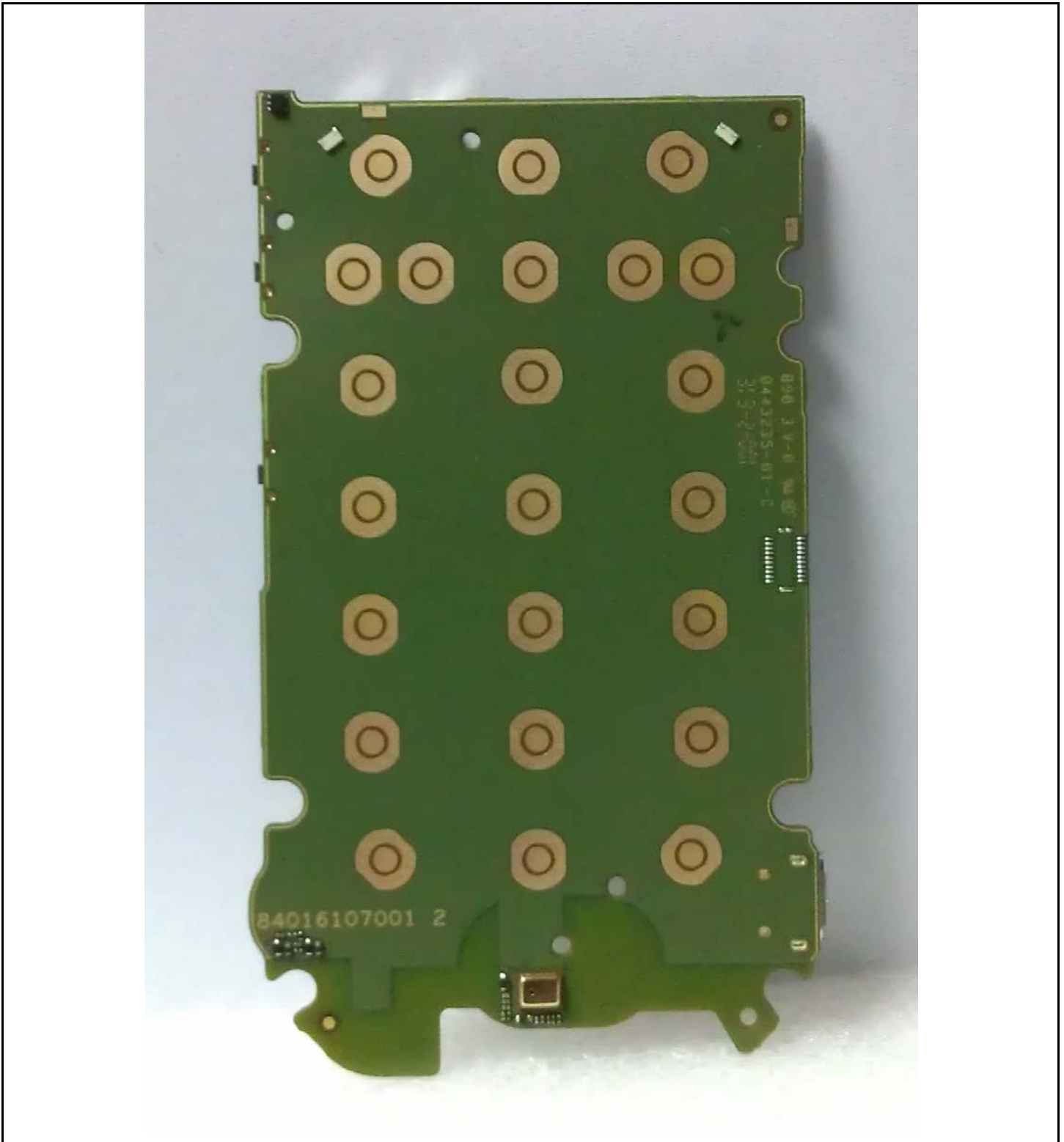
Photograph 9-1: Front side view of the device's PC Board.