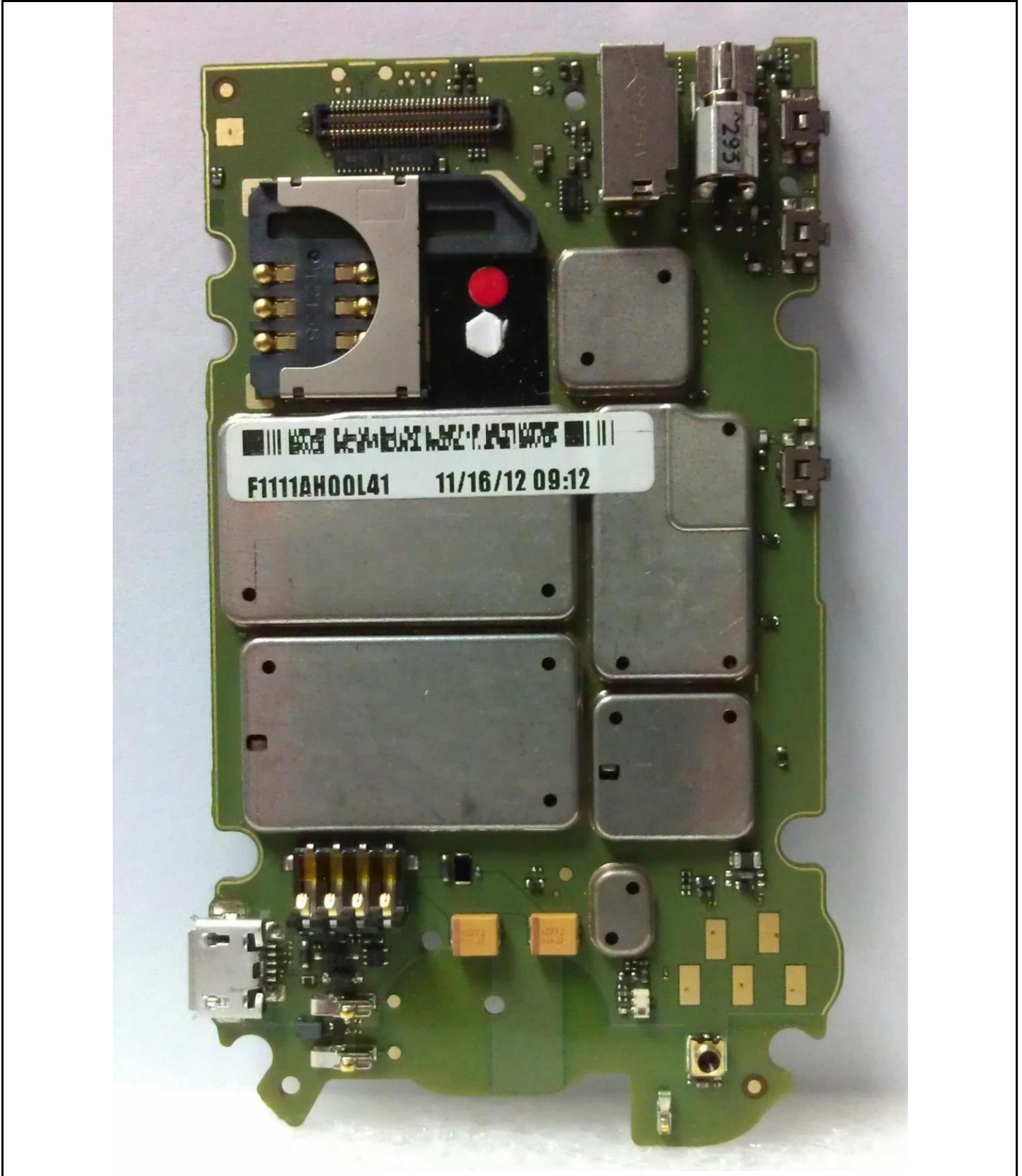
Photograph 9-2: Back side view of the device's PC Board, Shields in place.