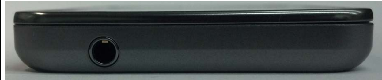
Figure 3-5. Top of radio