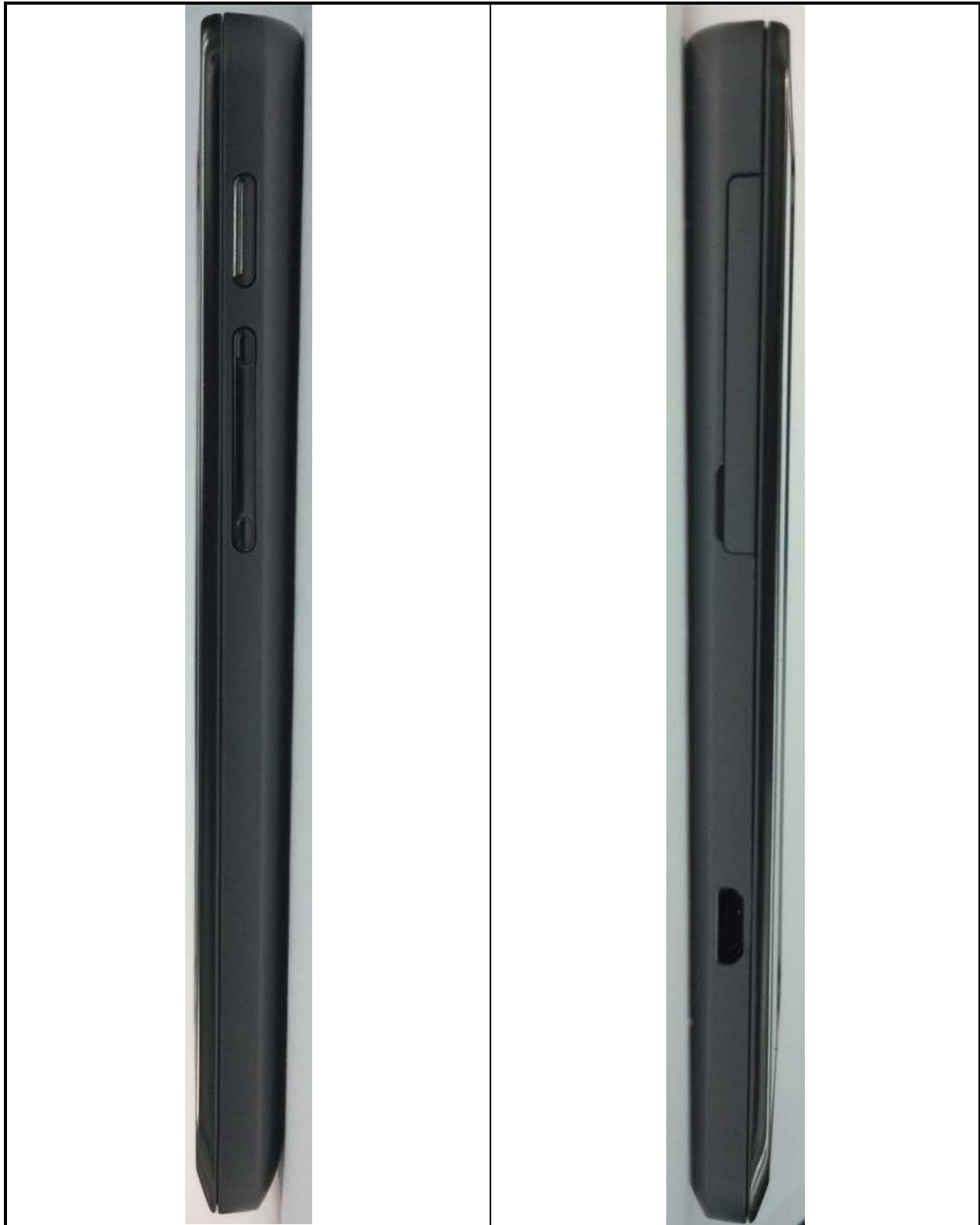
Figure 3-3. Button Side of device