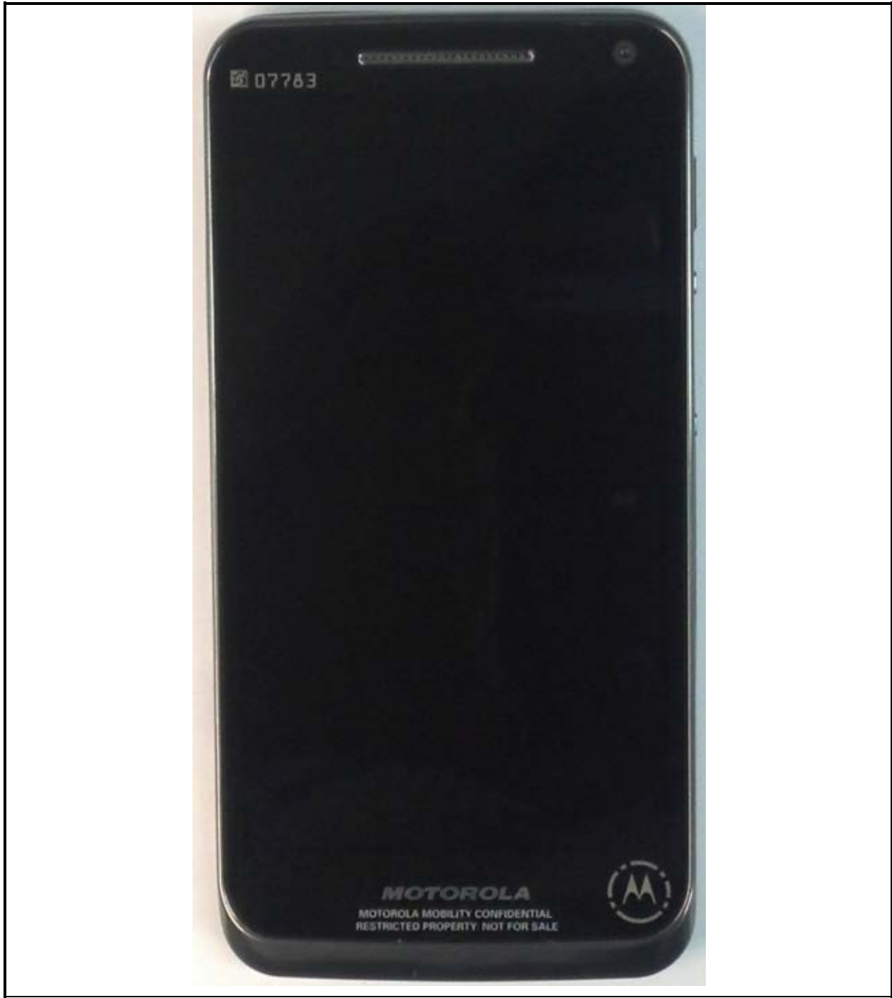
Figure 3-1. Front of device

The radio product colors, housings/bezels may vary, but only consistent with the requirements of FCC Class I Permissive Change rules and guidance (47 CFR 2.1043 and KDB 178919 D01).