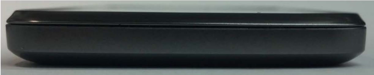
Figure 3-6. Bottom of radio