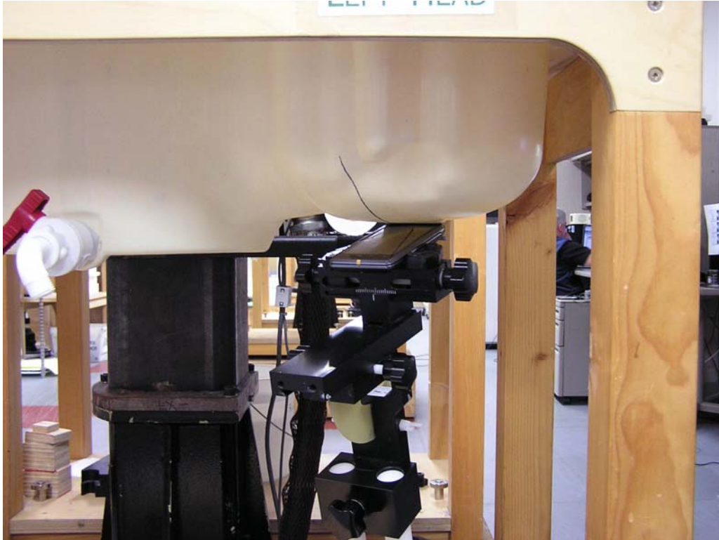
Figure 5: Tilt Position, Front of Head of Phantom