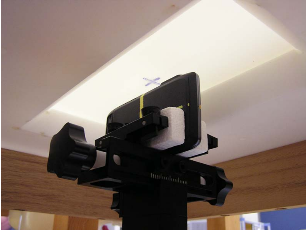
Figure 9: Mobile Hotspot Position, Left Edge of Phone facing Phantom (10 mm separation)