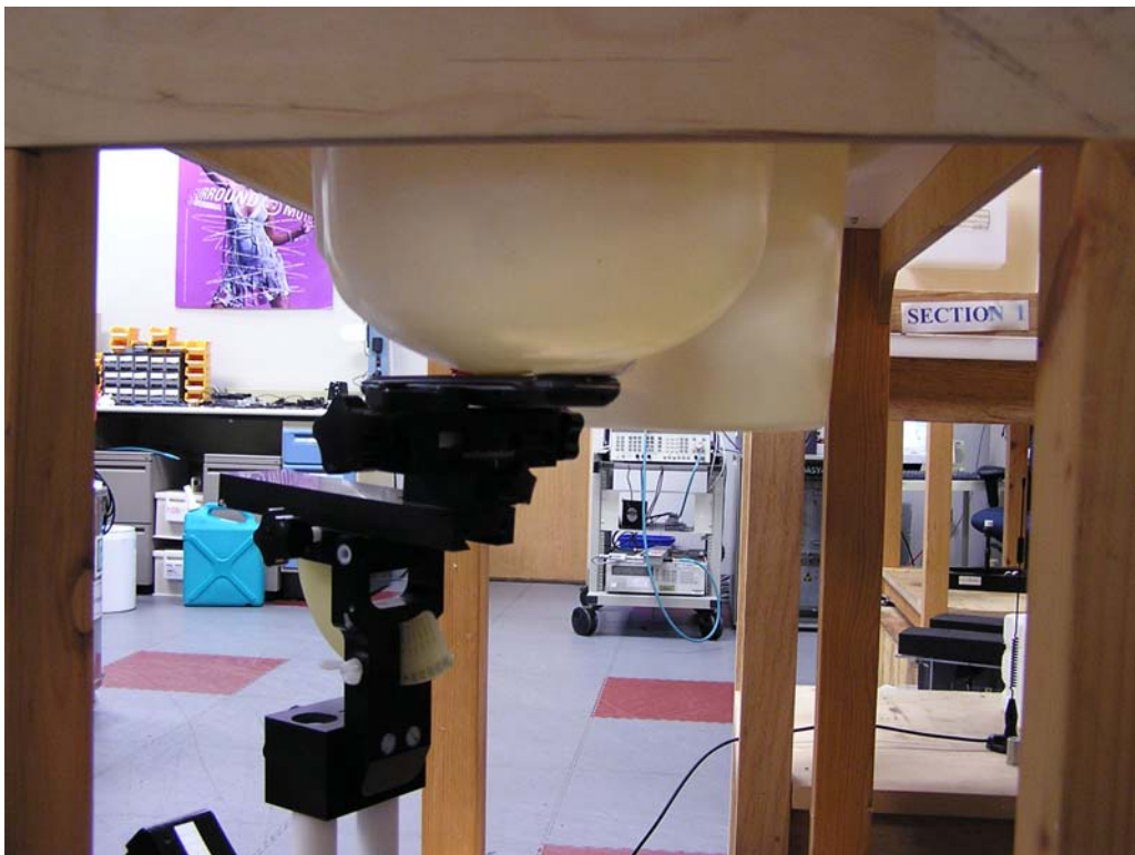
Figure 4: Cheek Position, Top of Head of Phantom