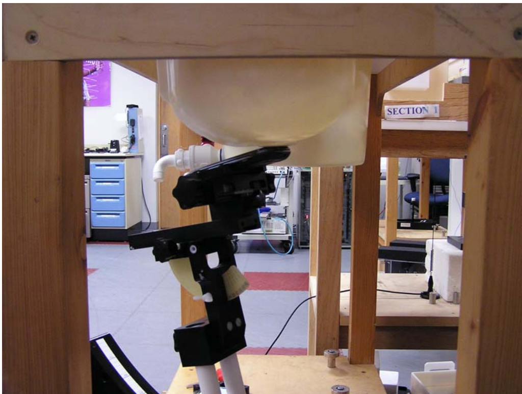
Figure 6: Tilt Position, Top of Head of Phantom