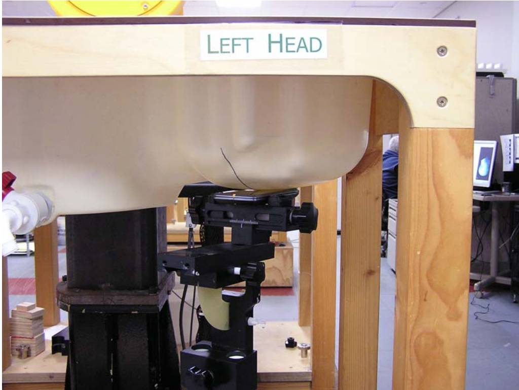
Figure 3: Cheek Position, Front of Head of Phantom