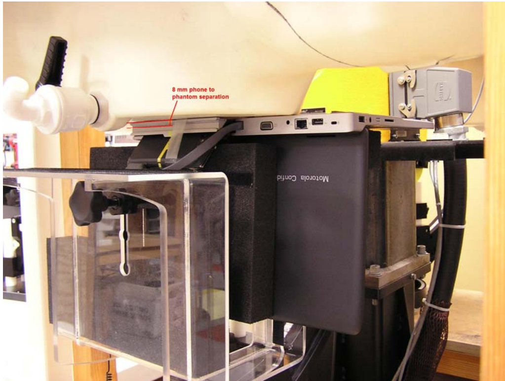
Figure 11: Phone with LapDock™