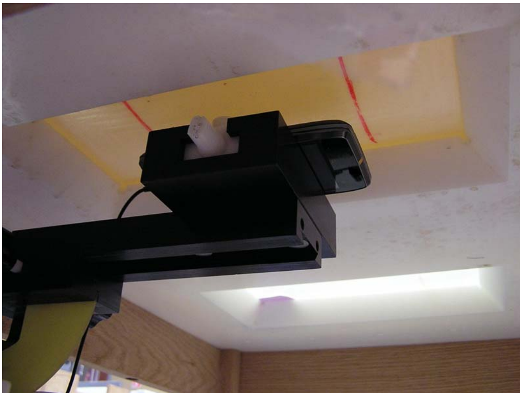
Figure 7: Body Position (25 mm separation, with audio cable shown)