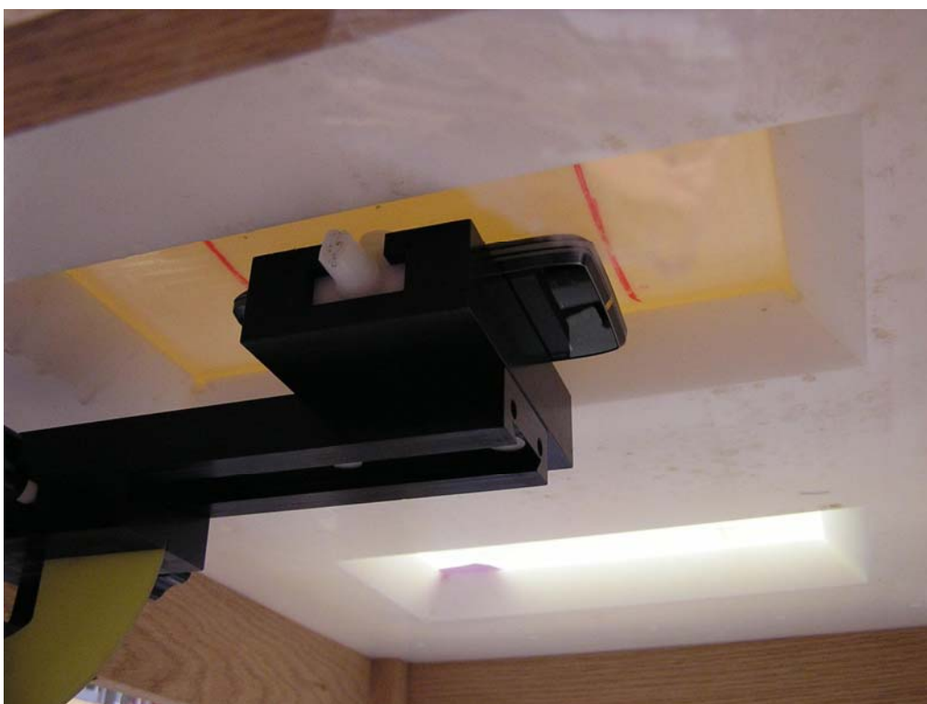
Figure 8: Mobile Hotspot Position, Back of Phone facing Phantom (10 mm separation)