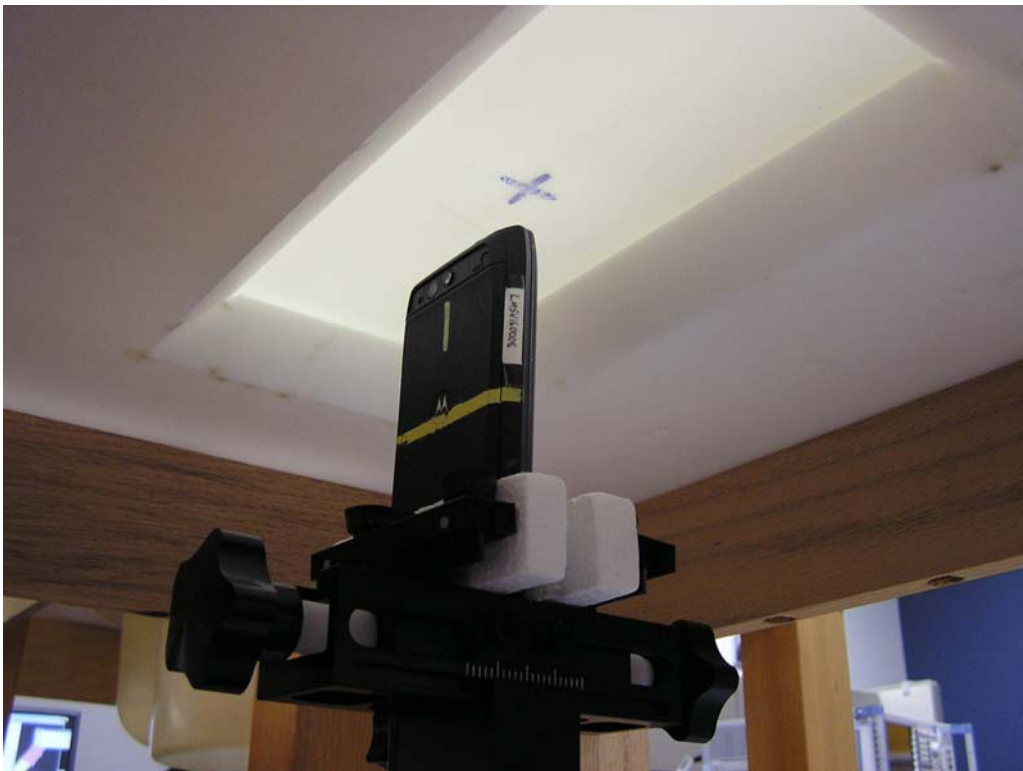
Figure 10: Mobile Hotspot Position, Top Edge of Phone facing Phantom (10 mm separation)