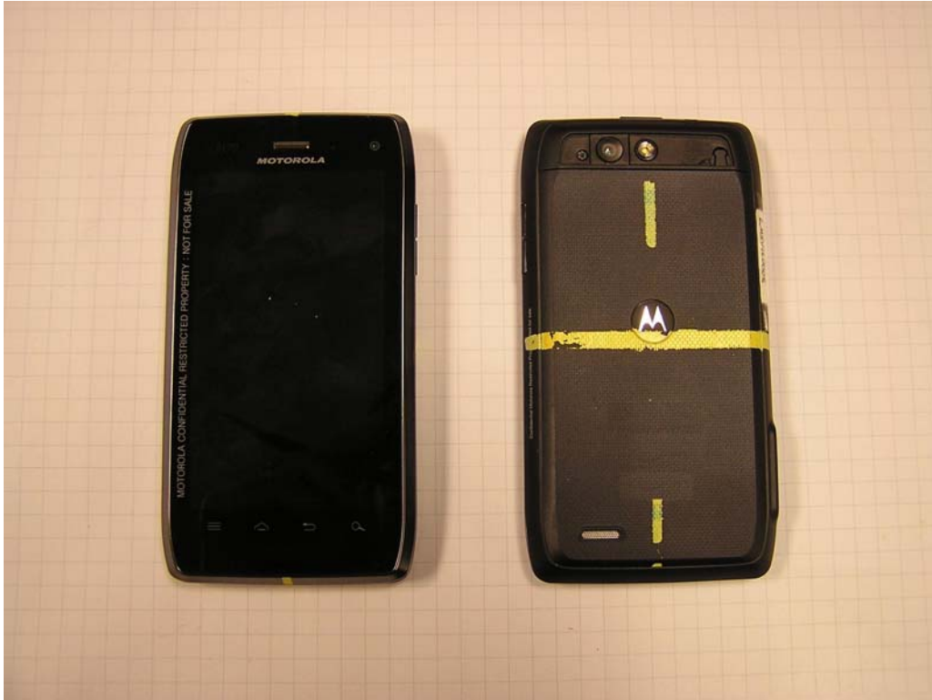
Figure 1: Phone Front and Back