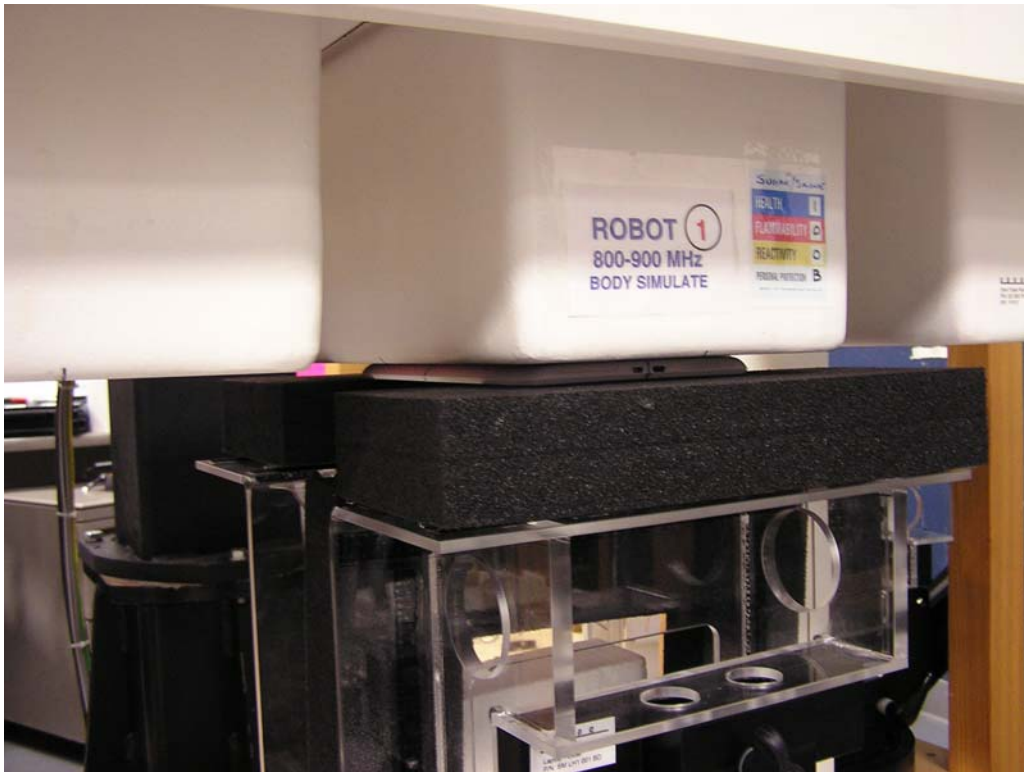
Figure 2: Back Surface of DUT toward Phantom, 0 mm Separation