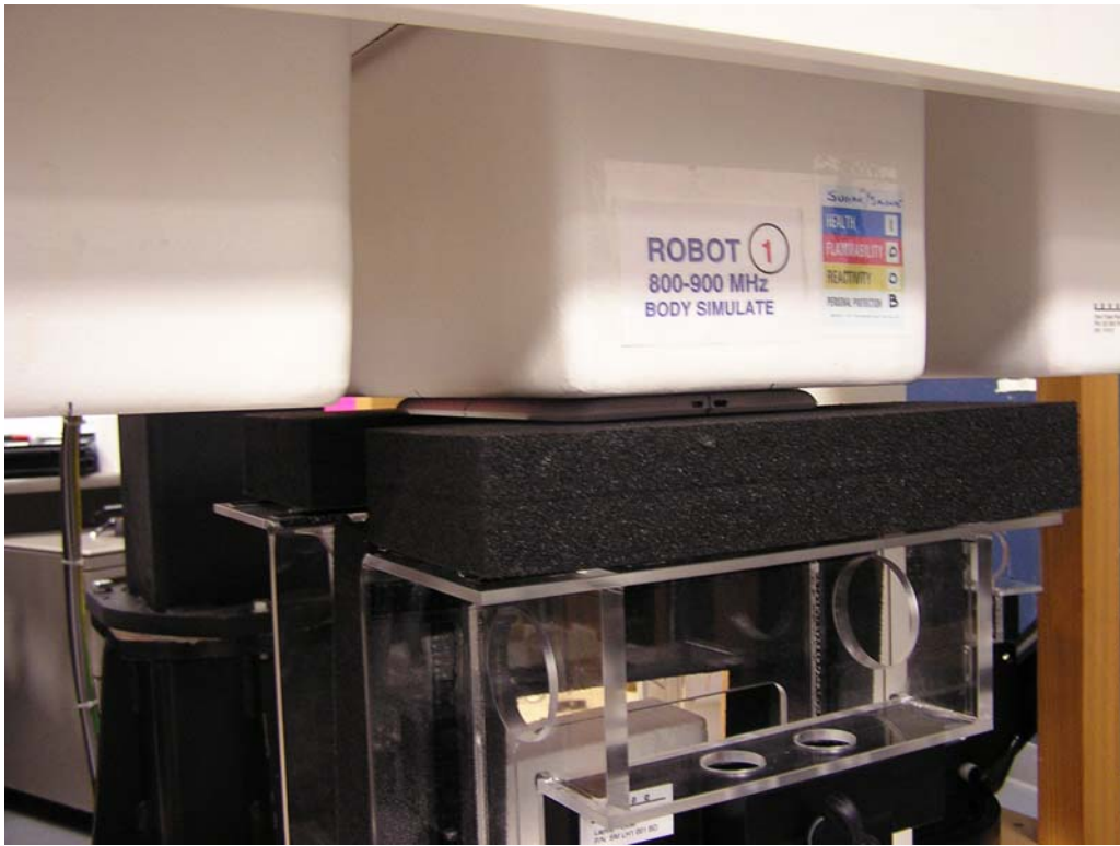
Figure 2: Back Surface of DUT toward Phantom, 0 mm Separation