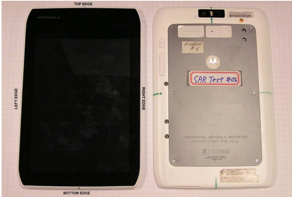
Figure 1: DUT Front and Back Surface