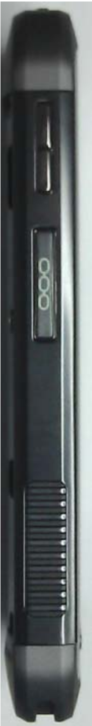
Figure 3-3. Button Side of radio