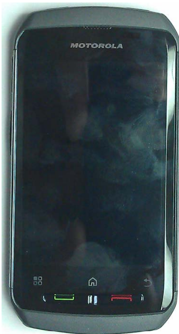
Figure 3-1. Front of radio

The radio product shapes, colors and housings/bezels may vary.