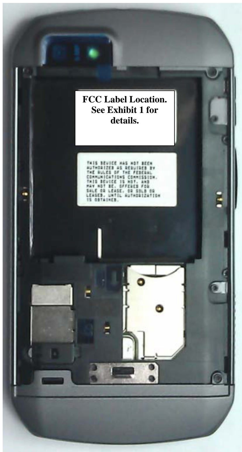
Figure 3-7. Interior Compartment of radio