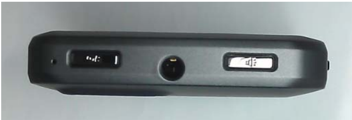
Figure 3-5. Top of radio