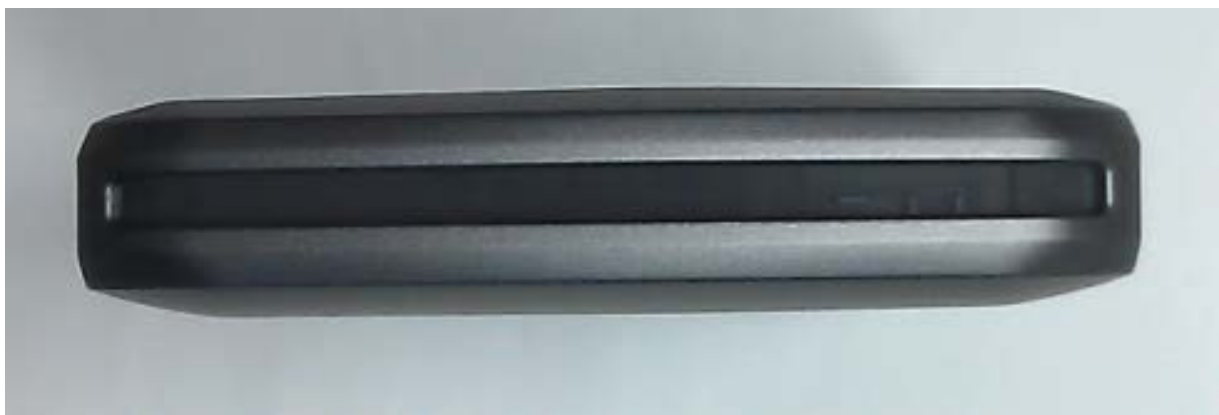
Figure 3-6. Bottom of radio