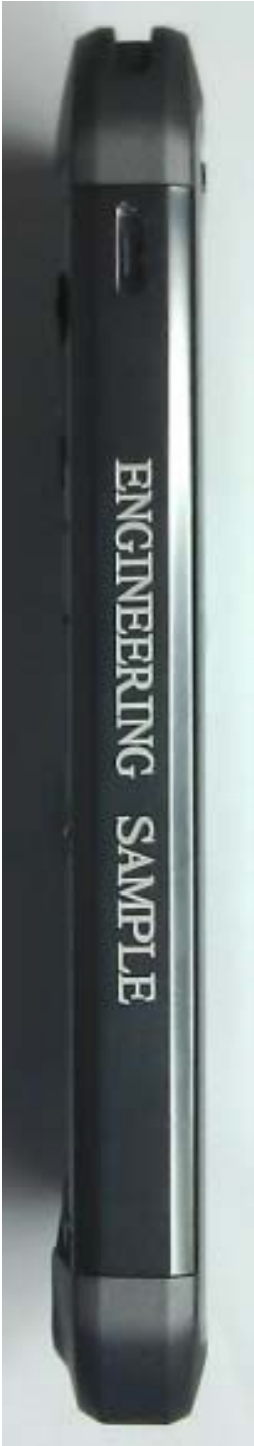
Figure 3-4. Opposite Side of radio