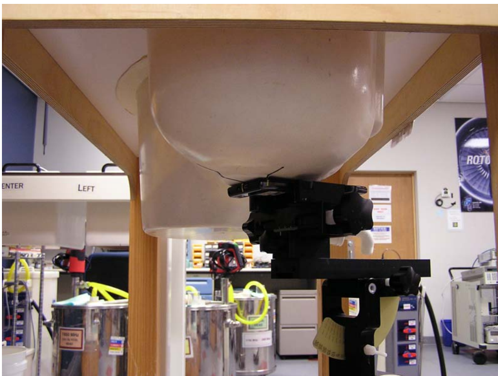
Figure 4: Cheek Position, Top of Head of Phantom