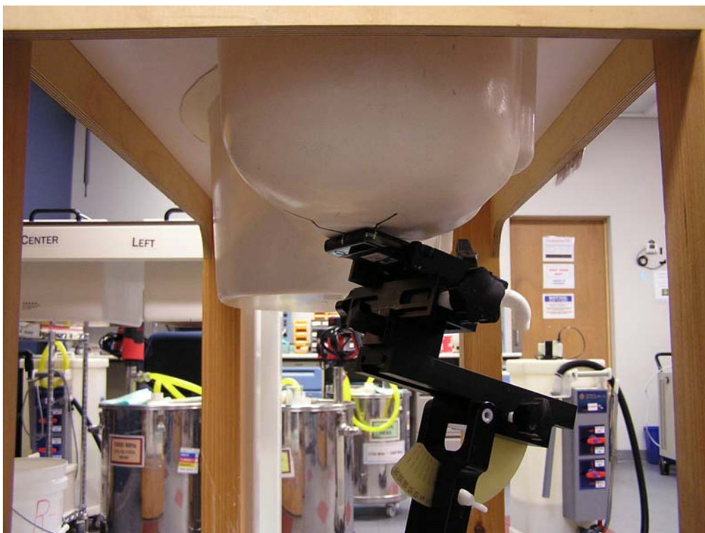
Figure 6: Tilt Position, Top of Head of Phantom