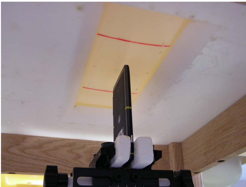
Figure 10: Mobile Hotspot Position, Bottom Edge of Phone facing Phantom (10 mm separation)