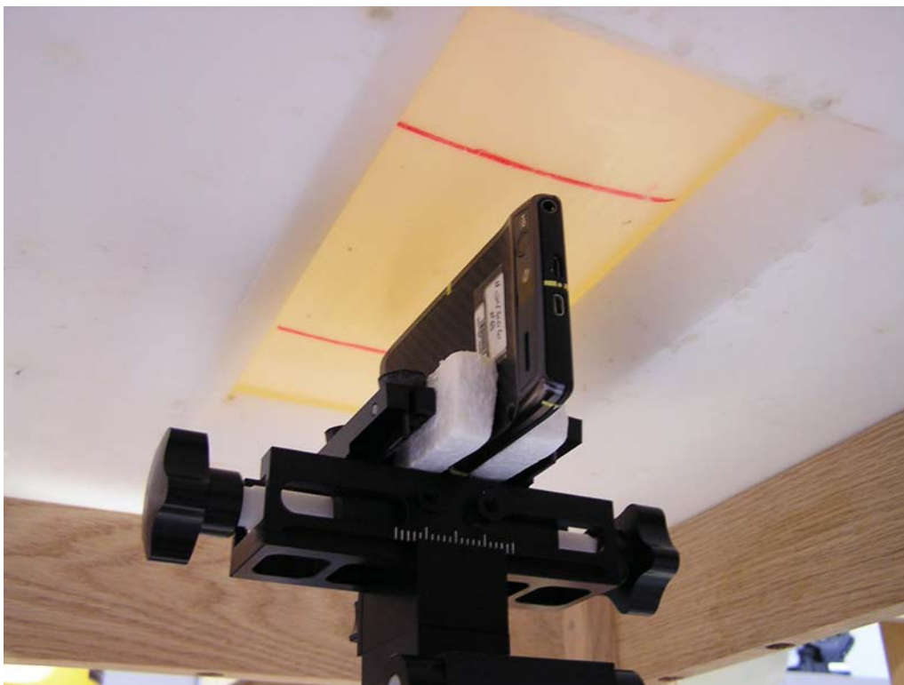
Figure 9: Mobile Hotspot Position, Right Edge of Phone facing Phantom (10 mm separation)