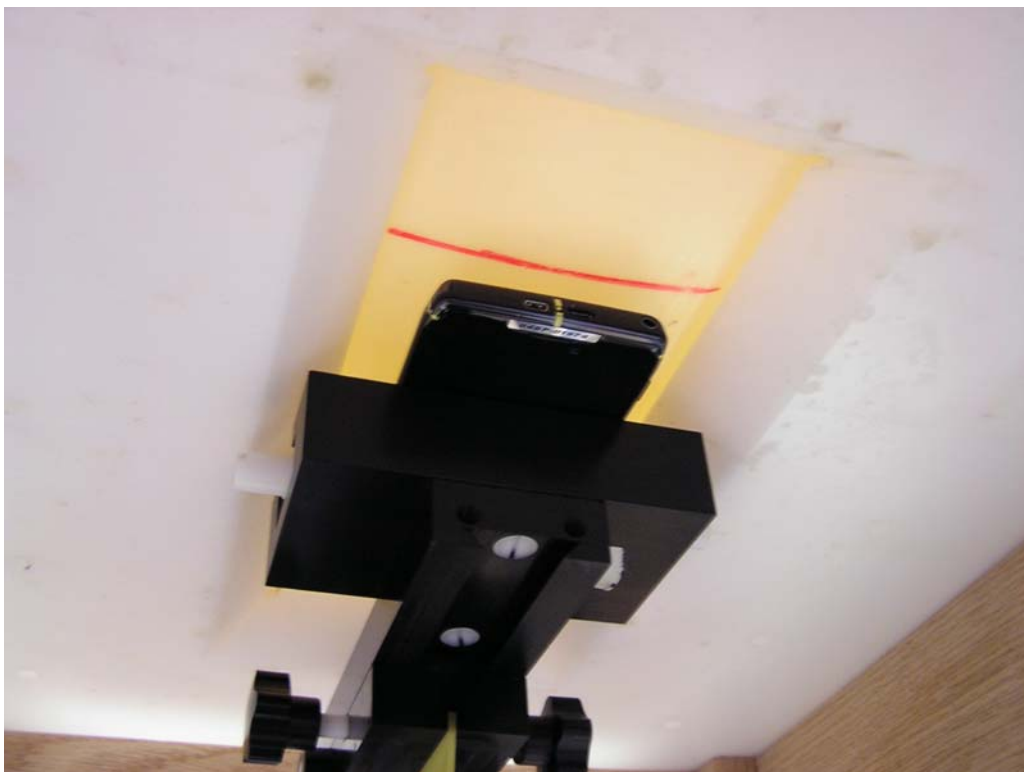
Figure 8: Mobile Hotspot Position, Back of Phone facing Phantom (10 mm separation)