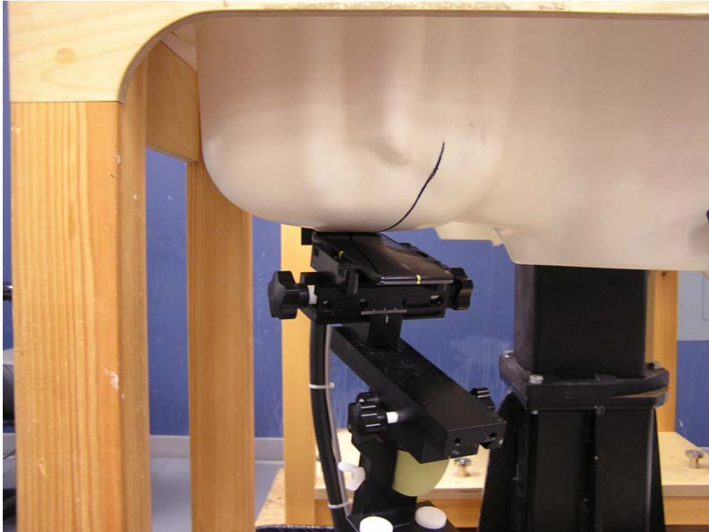
Figure 5: Tilt Position, Front of Head of Phantom