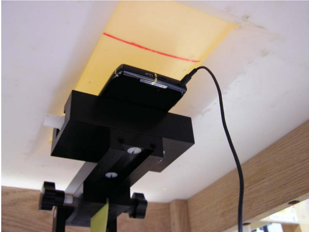
Figure 7: Body Position (25 mm separation)