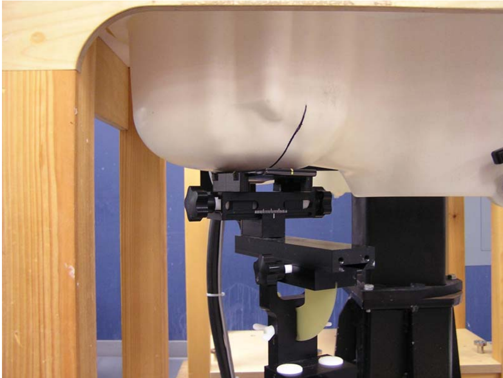
Figure 3: Cheek Position, Front of Head of Phantom