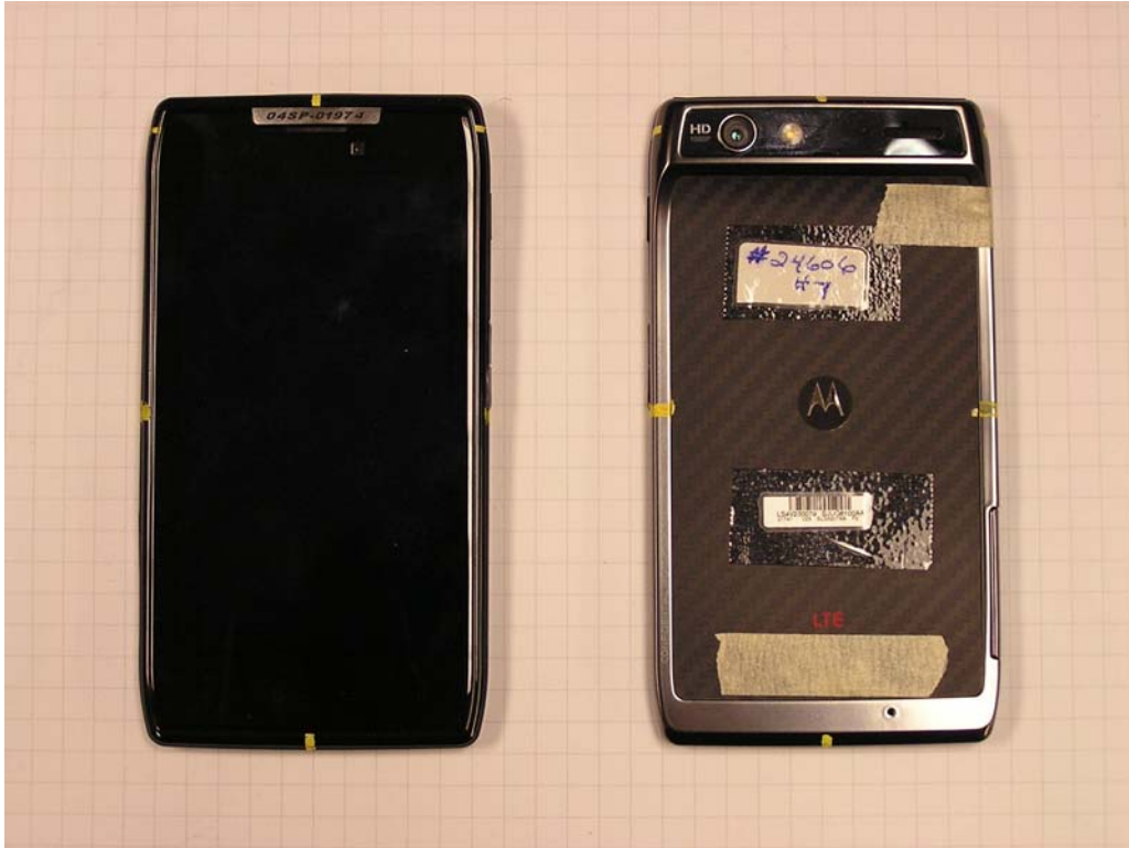
Figure 1: Phone Front and Back