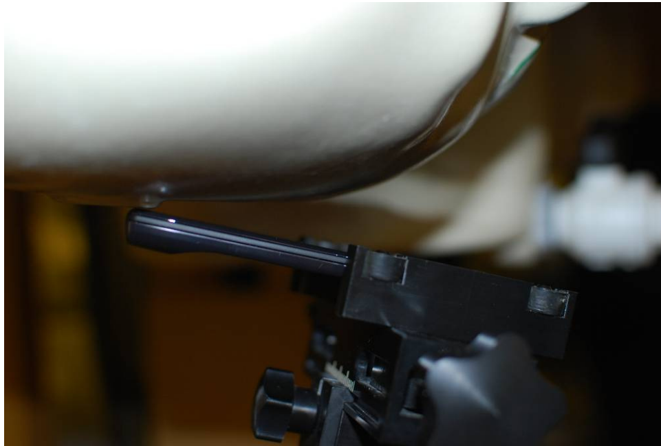
SAR Test Setup Photo 2- Right Tilt