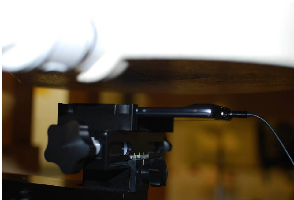
SAR Test Setup Photo 5- Body-Worn Back at 2.5 cm