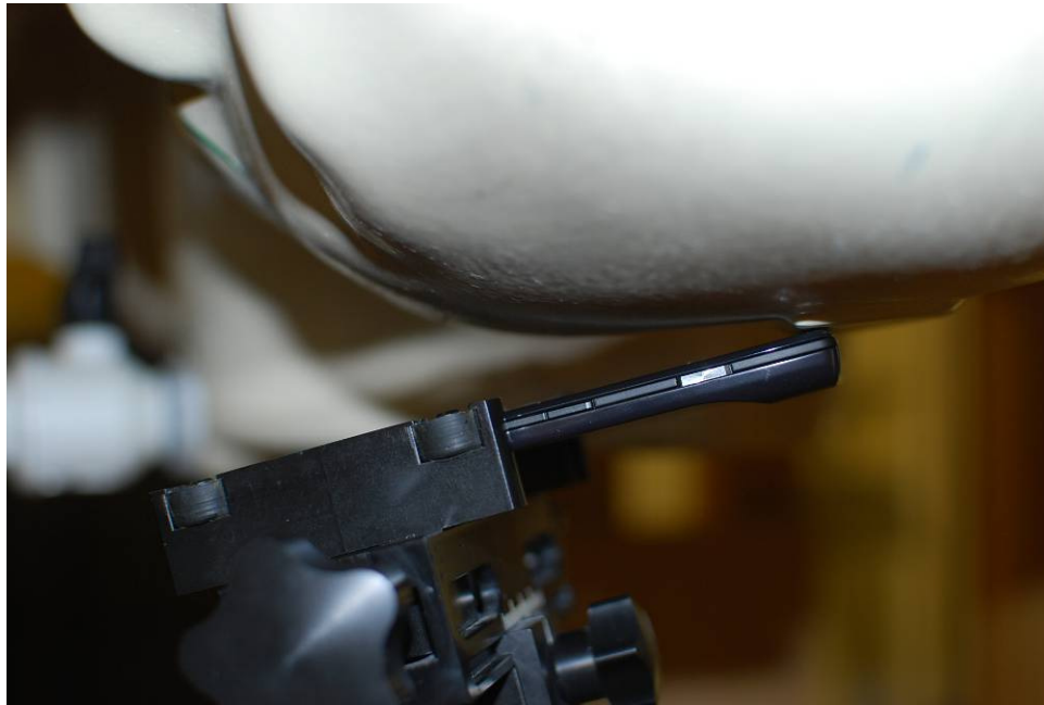
SAR Test Setup Photo 4- Left Tilt