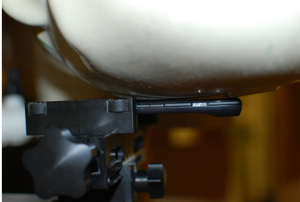
SAR Test Setup Photo 3- Left Touch