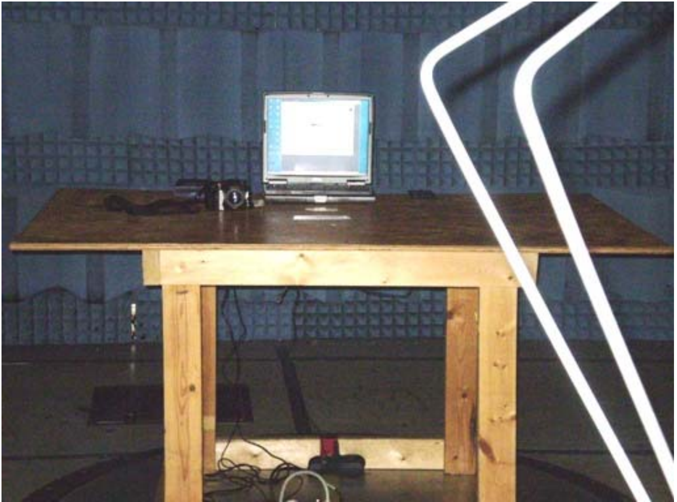
Figure 2: Part 15B, Computer Peripheral Test Set-up.