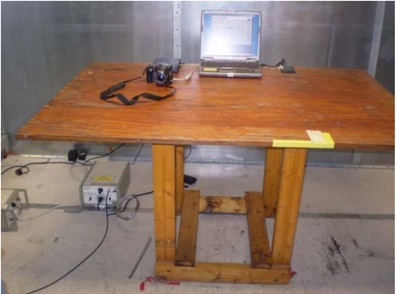
Figure 1: Part 15 AC Line Spurious Voltages Test Set-up.