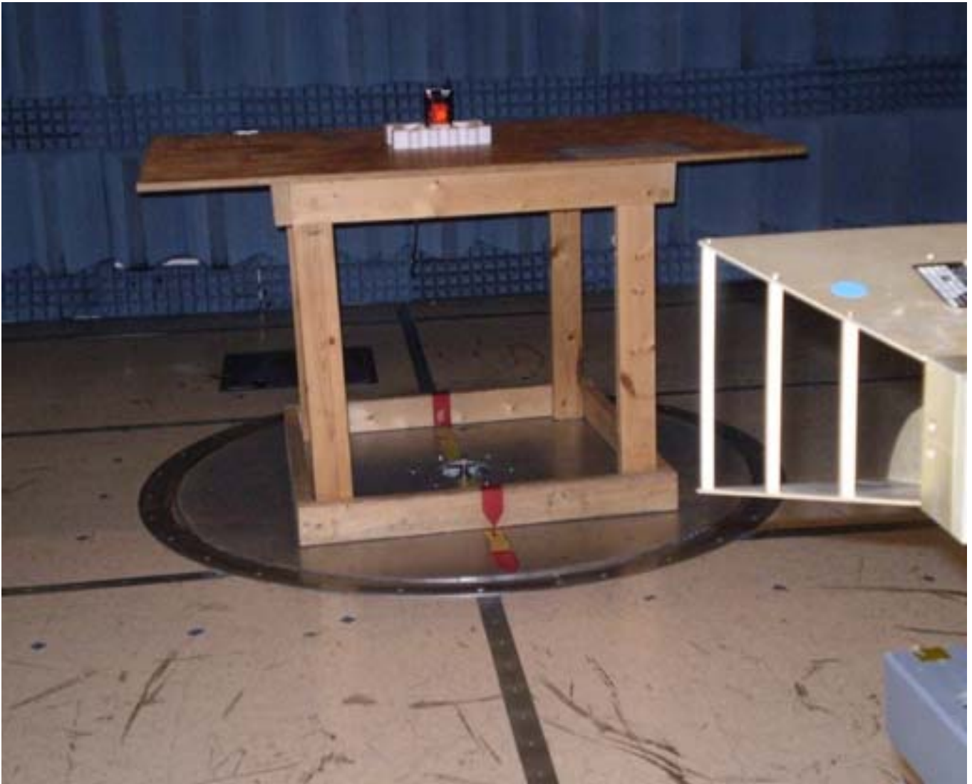
Figure 4: Transmitter Spurious Emissions Test Set-up.