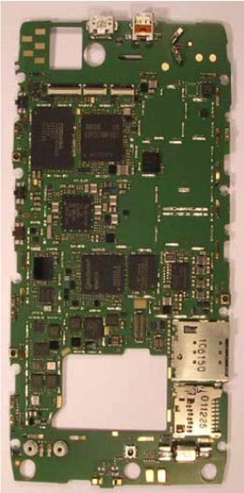
Photograph 9-2: Front side view of the device's PC Board, Shields Removed.