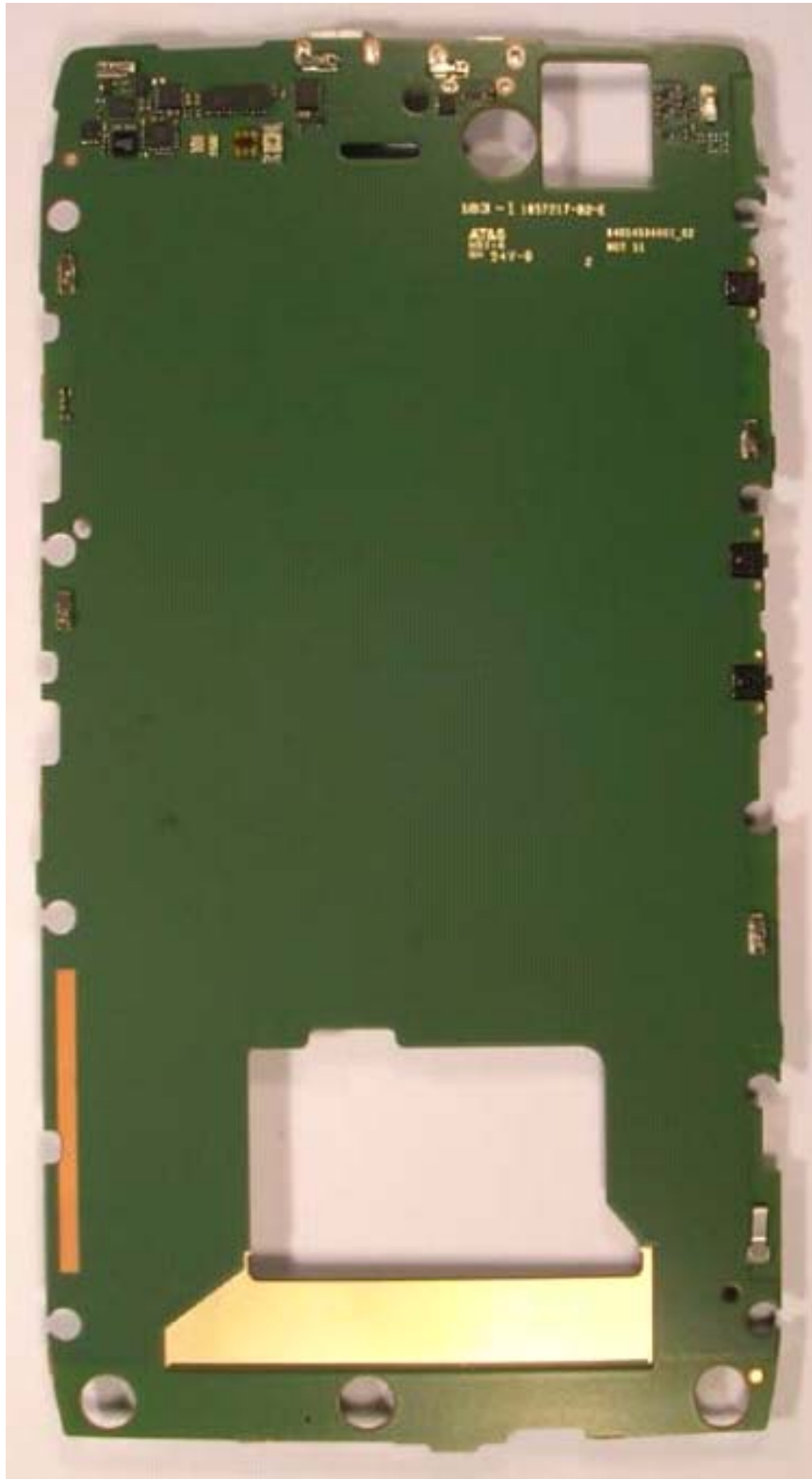
Photograph 9-3: Back side view of the device's PC Board, No Shielding in Design.