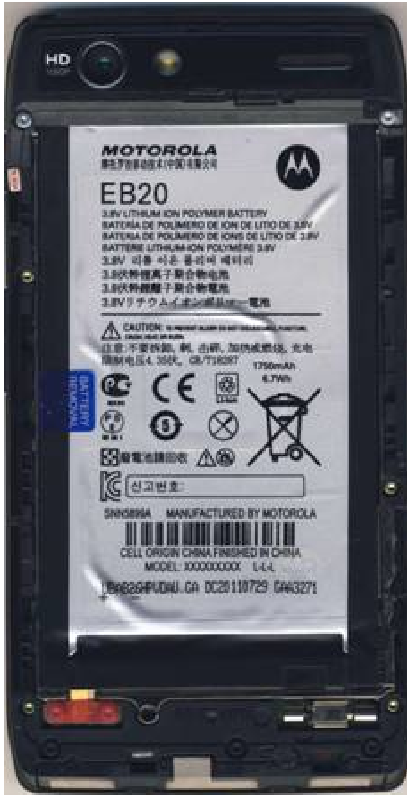
Photograph 9-4: Housing Interior, Showing Battery and Antennas (at the periphery).