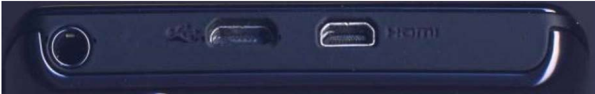
Figure 3-4. Top of device