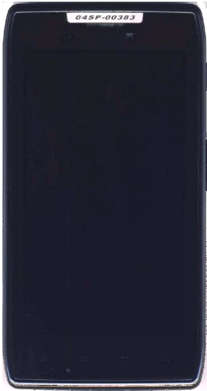
Figure 3-1. Front of device

The radio product shapes, colors and housings/bezels may vary.