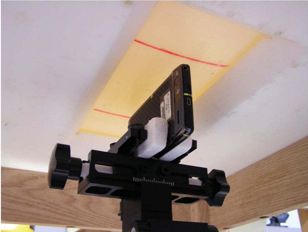
Figure 9: Mobile Hotspot Position, Right Edge of Phone facing Phantom (10 mm separation)