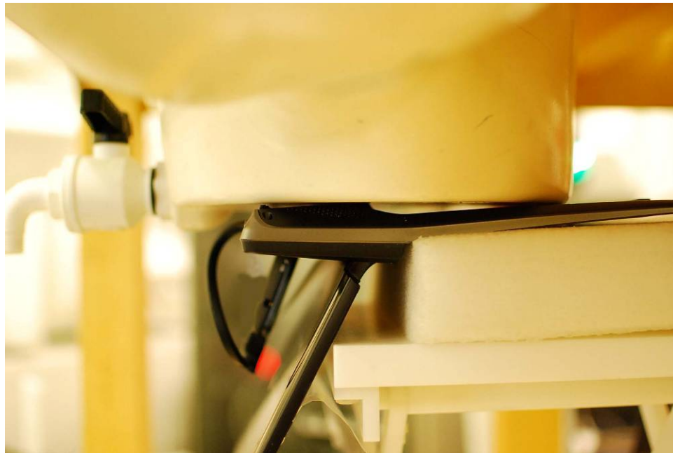
SAR Test Setup Photo 2 – Lapdock Side View