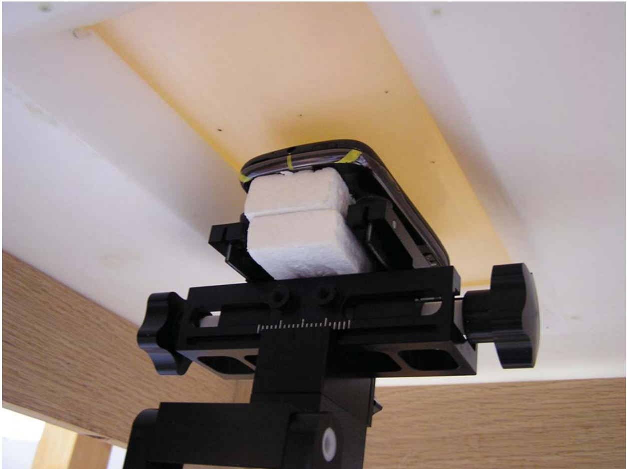
Figure 8: Body Position