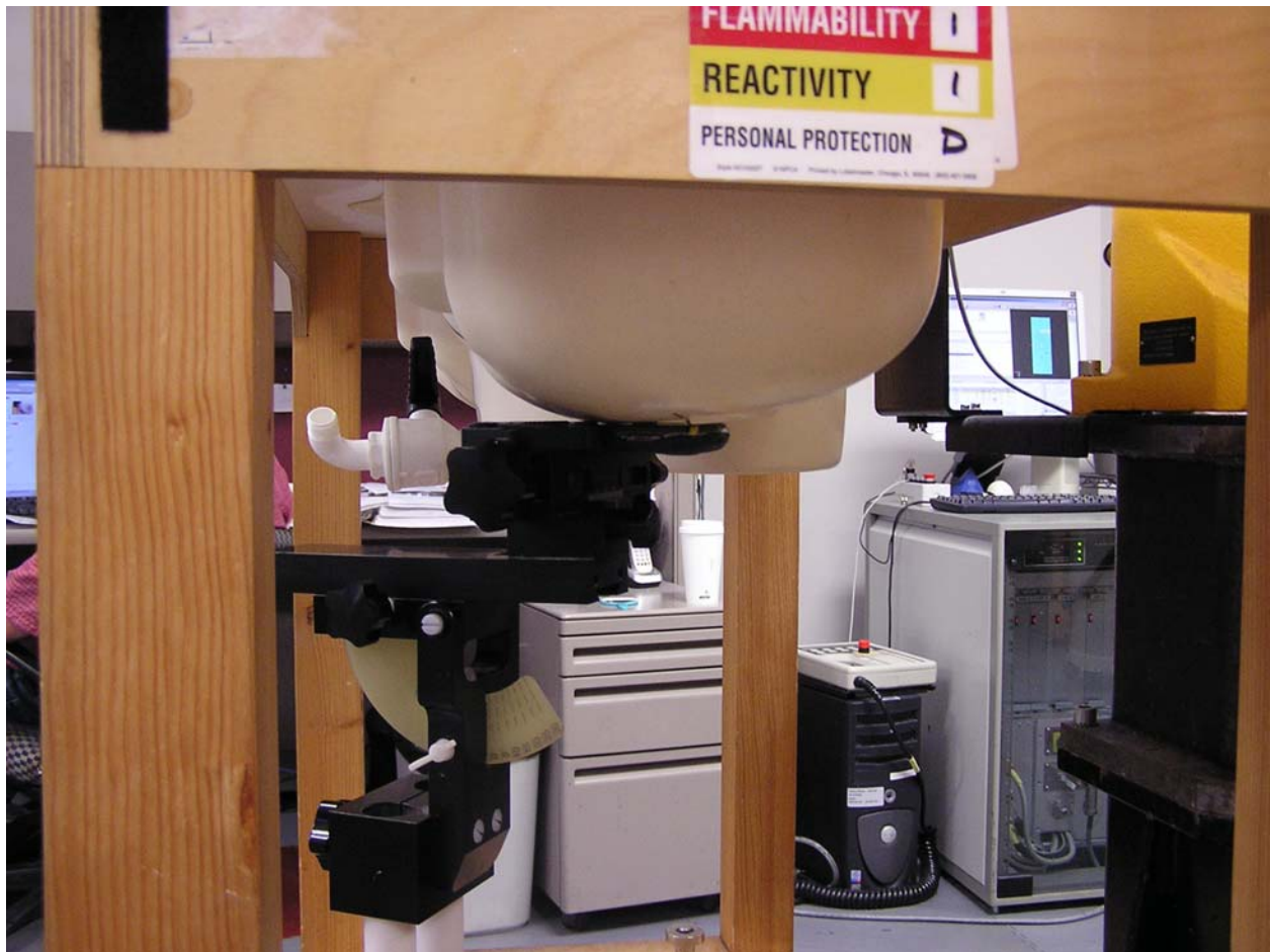
Figure 4: Cheek Position, Top of Head of Phantom