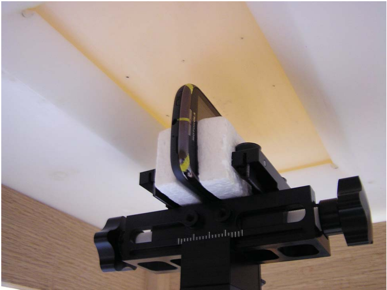
Figure 9: 10mm Separation from Left Edge Position