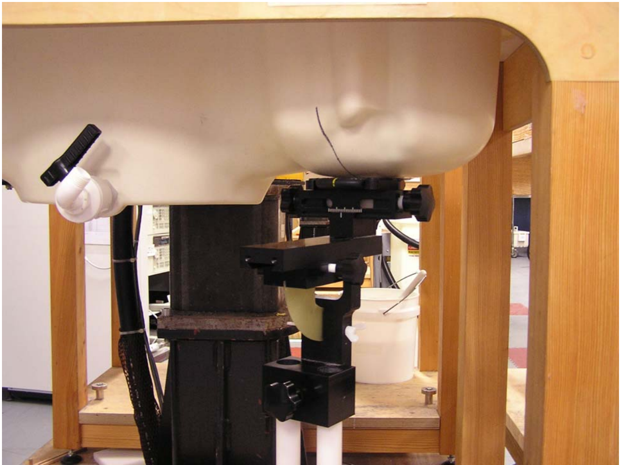
Figure 3: Cheek Position, Front of Head of Phantom