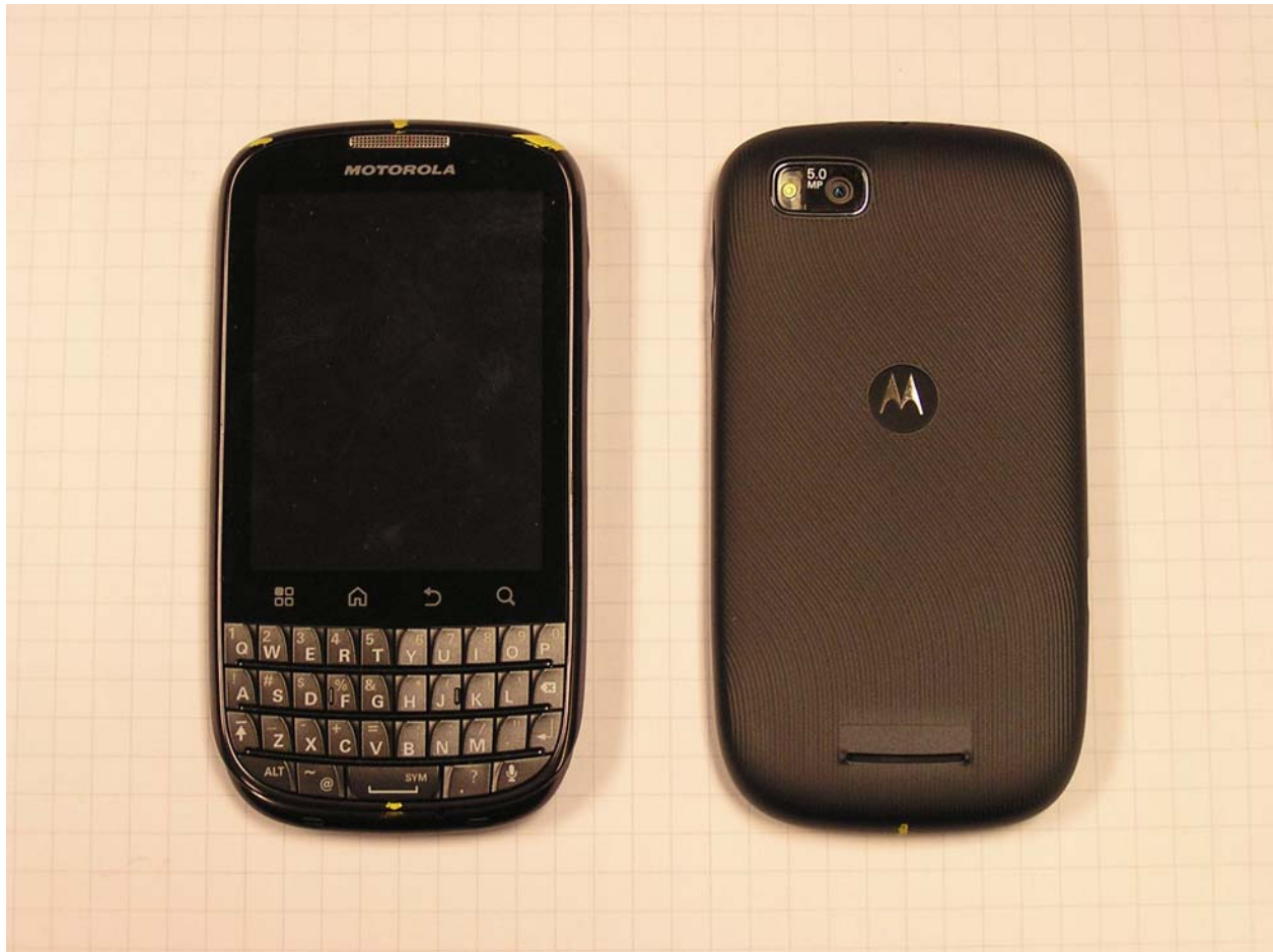
Figure 1: Phone Front and Back, Flip closed