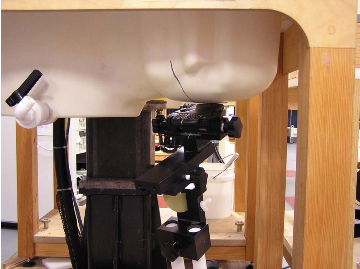
Figure 5: Tilt Position, Front of Head of Phantom