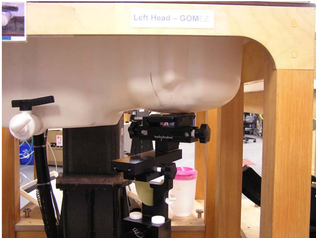
Figure 3: Cheek Position, Front of Head of Phantom