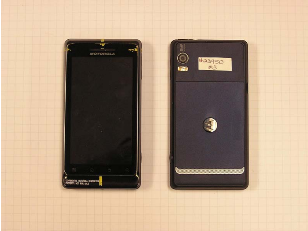
Figure 1: Phone Front and Back, Flip Closed