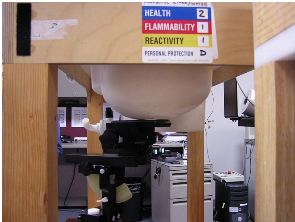
Figure 4: Cheek Position, Top of Head of Phantom