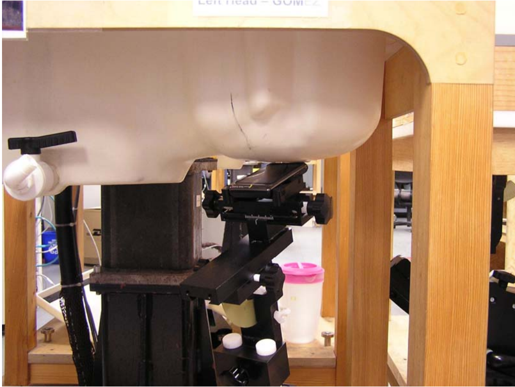
Figure 5: Tilt Position, Front of Head of Phantom