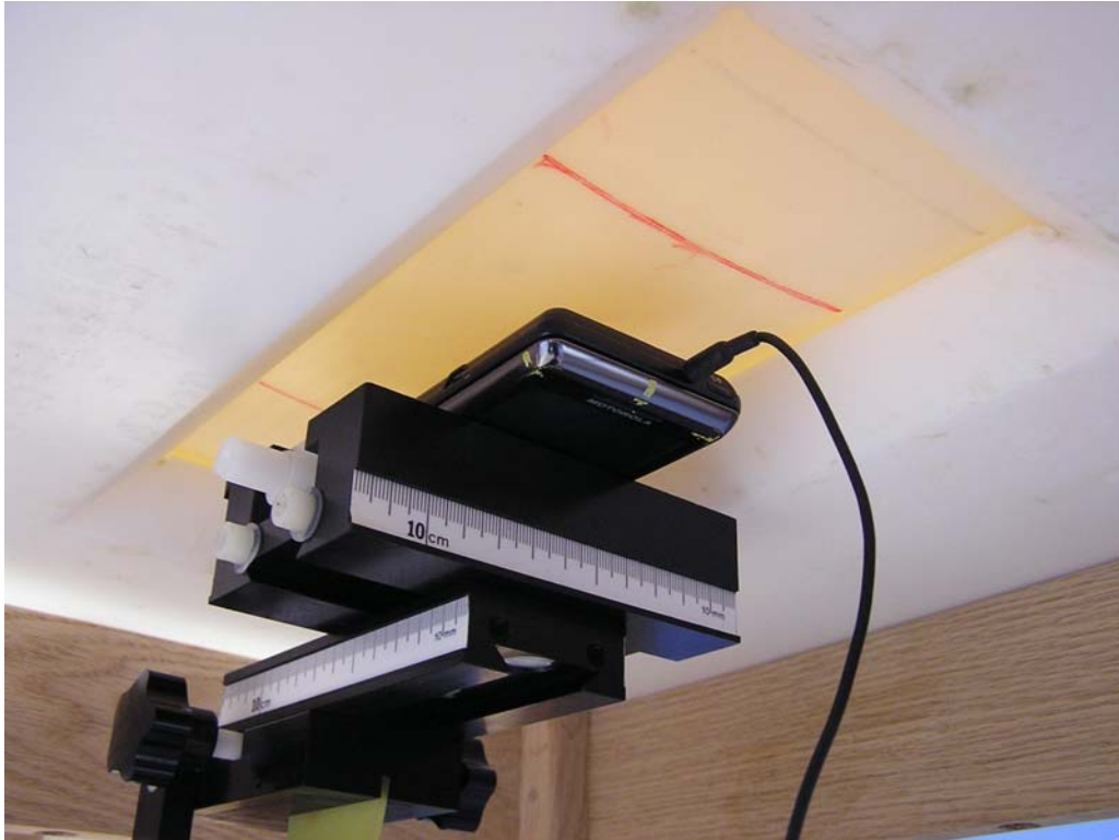
Figure 7: Body Position, 15 mm separation