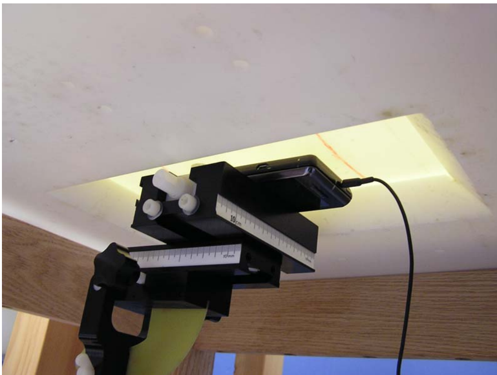
Figure 8: Body Position, 10 mm separation