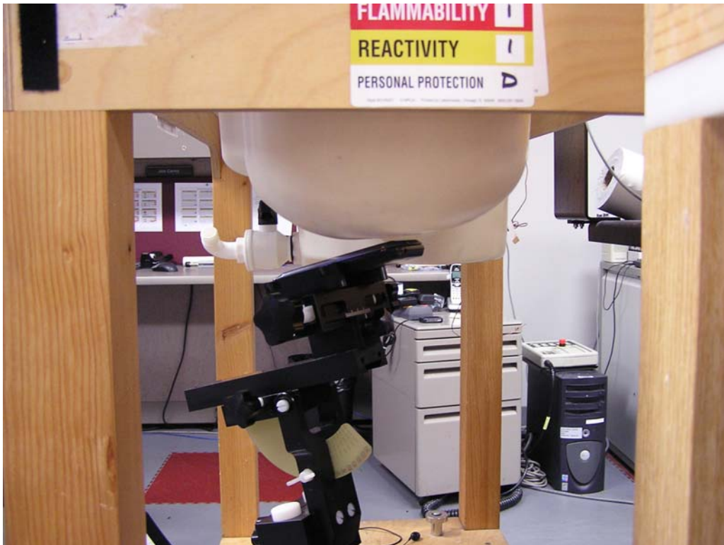
Figure 6: Tilt Position, Top of Head of Phantom